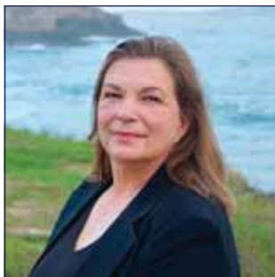
Creating Peace of Mind for You ~Security for Your Family~

DECARLI LAW WILLS • TRUSTS • ESTATE PLANNING