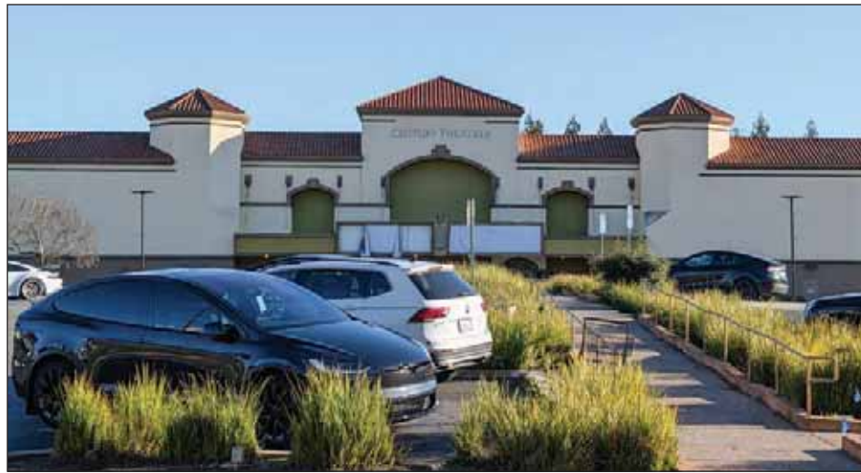
The vacant theater at Blackhawk Plaza on Jan. 16.

Although that opening date was later postponed, Apple Cinemas had remained steadfast in their statements that the theater was nonetheless still coming, even amid