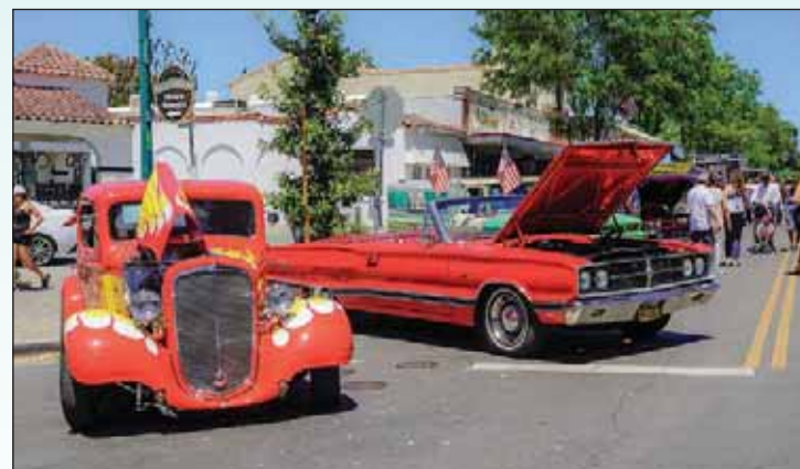
The Pleasanton Downtown Association has announced its full lineup of special events on and around Main Street during 2026, including the return of Concerts in the Park (top left,) and Weekends on Main with Pleasanton Palooza (top right and above).

“Families are invited downtown for an afternoon of Halloween