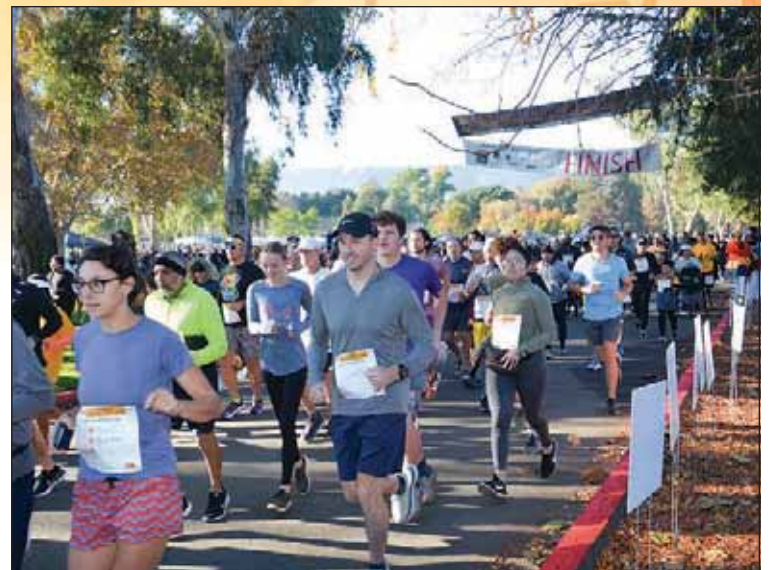
The Tri-Valley Turkey Burn's popularity was well-established by 2023 when more than 2,200 walkers and runners passed the starting line.

Rotary Youth Leadership Awards (RYLA) and Rotary International Youth Exchange are especially noteworthy, according to Turkey Burn co-founder Kevin Greenlee.