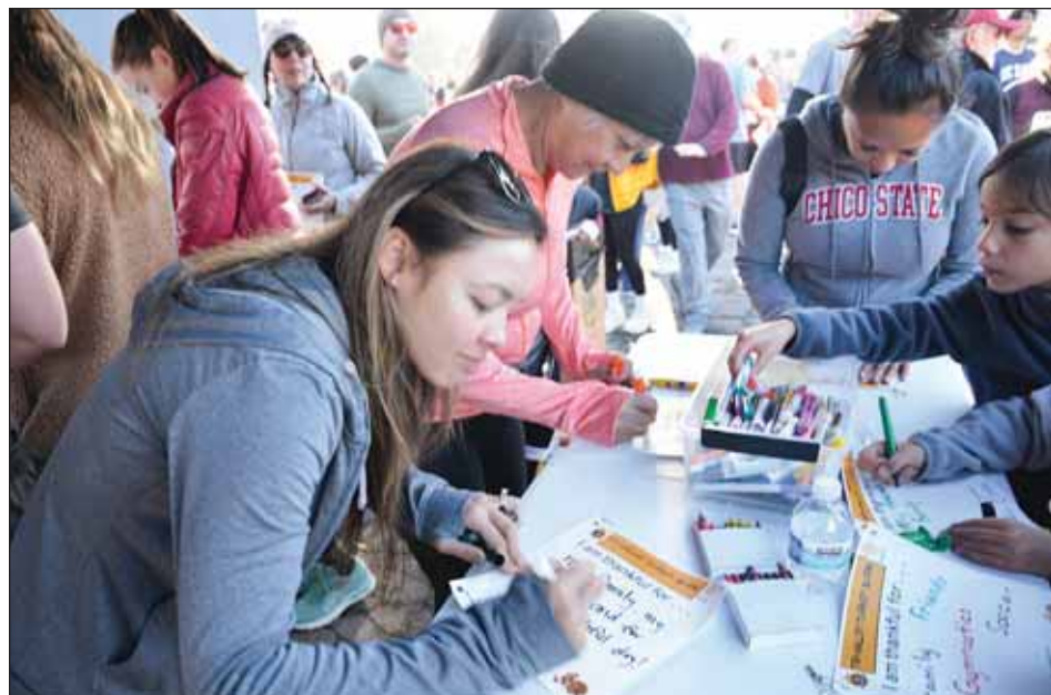
The enthusiasm for the Turkey Burn's "I am thankful for ..." bibs helped propel its evolution into a community-wide event.