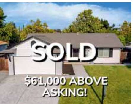
1230 LAKEHURST RD, LIVERMORE SOLD $1,360,000