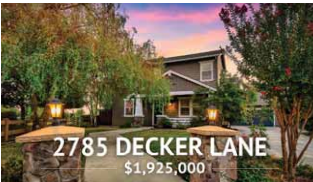
2785 DECKER LANE $1,925,000