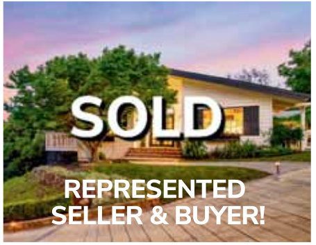
399 OAK LANE, PLEASANTON SOLD $2,425,000