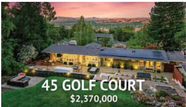
45 GOLF COURT $2,370,000