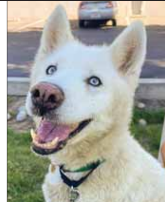
EAST BAY SPCA

Hi, my name is Cherry! Aply named for my charming and sweet disposition, I am 8 years old and get tuckered out easily as I adapt to being a tripod. I'm ready for snuggles in the meantime, but soon I'll build up the right muscles to move around like the spry doggo I am. My favorite thing to do is lay with you while you work, or rest in the sun on a picnic. I am a part of the October Shepherd/Husky Homecoming Special, which means my adoption fees are covered. Come out to Dublin soon to meet me or visit my profile at eastbayspca.org .