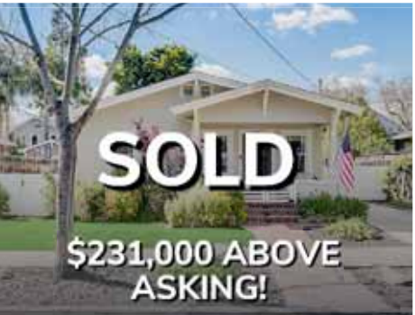
4443 2ND ST, PLEASANTON SOLD $1,930,000