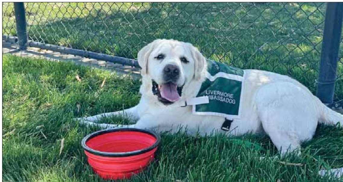
Inaugural Livermore Ambassadog Boomer Bowers, who died on Oct. 9, spent most of 2024 standing as his hometown's official canine representative.

"His boisterous personality, smile, and nonstop tail wagging brought comfort and joy to so