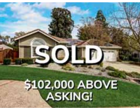
1057 BARTLETT PL, PLEASANTON SOLD $2,701,000