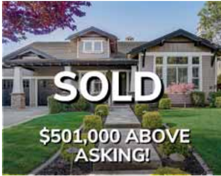
2823 VINE CT, LIVERMORE SOLD $2,400,001