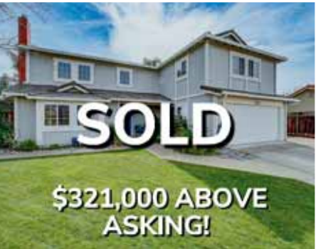
3657 DUNSMUIR CIR, PLEASANTON SOLD $2,320,000