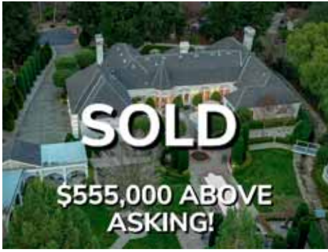
7810 BERNAL AVE, PLEASANTON SOLD $3,350,000