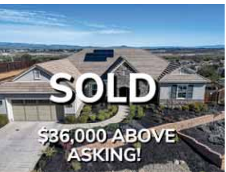
2311 SILVER OAKS LN, PLEASANTON SOLD $3,425,000