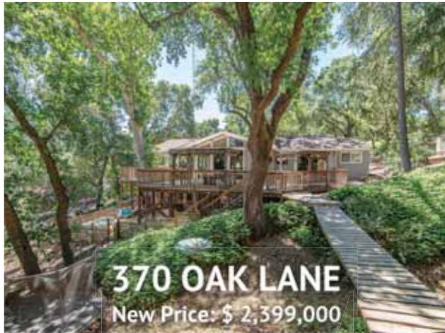
370 OAK LANE New Price: $ 2,399,000