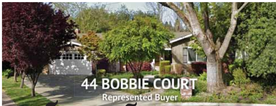
44 BOBBIE COURT Represented Buyer