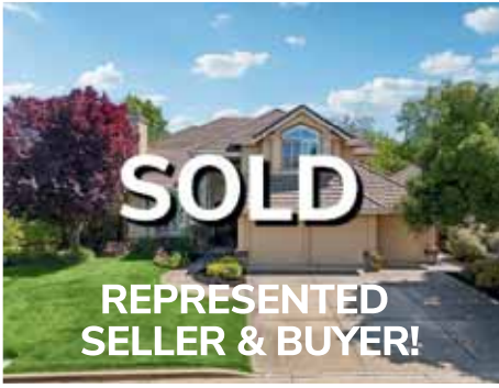
543 MONTORI COURT, RUBY HILL SOLD $2,872,100