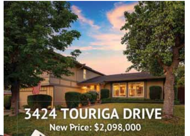
3424 TOURIGA DRIVE New Price: $2,098,000