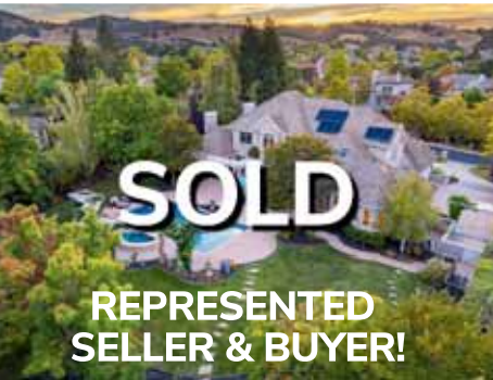
1619 ORVIETO COURT, RUBY HILL $4,200,000