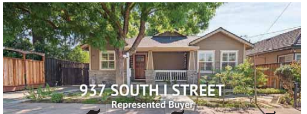
937 SOUTH I STREET Represented Buyer