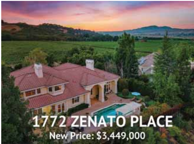
1772 ZENATO PLACE New Price: $3,449,000