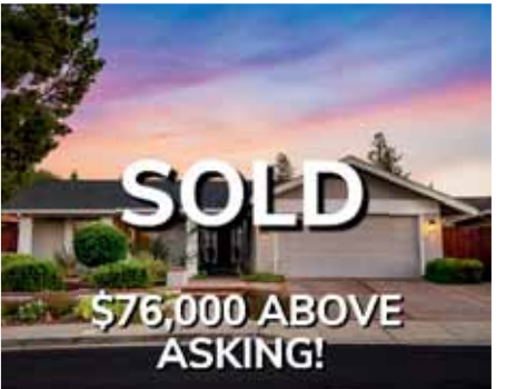
1045 RIESLING DR, PLEASANTON SOLD $1,925,000