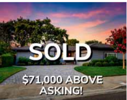
798 E ANGELA ST, PLEASANTON SOLD $1,750,000