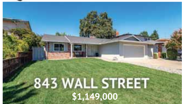
843 WALL STREET $1,149,000