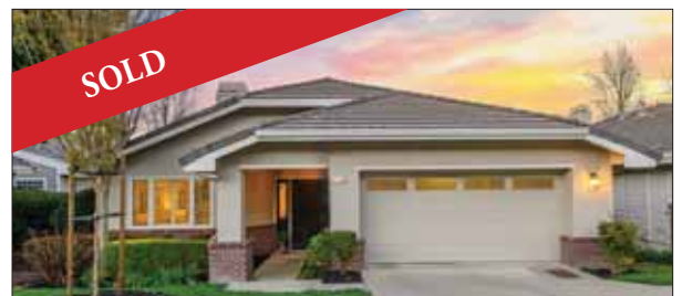
2173 INVERNESS COURT, PLEASANTON 3 BD | 2.5 BA | 2,520 SQ. FT. | 6,475 SQ. FT. LOT SOLD FOR $1,900,000