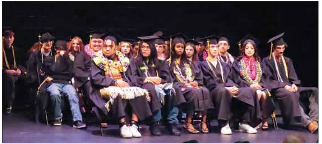
Village's graduating class of 2024 listens to teachers, staff and peers talk about the time each student spent at the school and how much that experience meant to each individual.