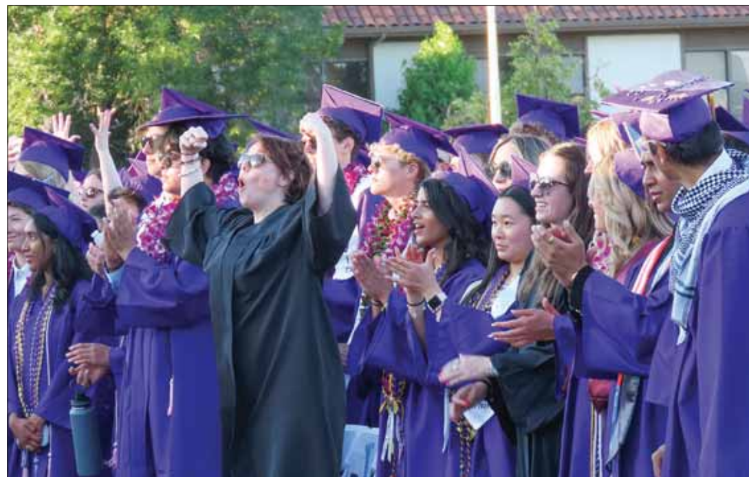
Amador Valley seniors and teachers passionately cheer and clap for the many performances and speeches during last week's graduation ceremony.