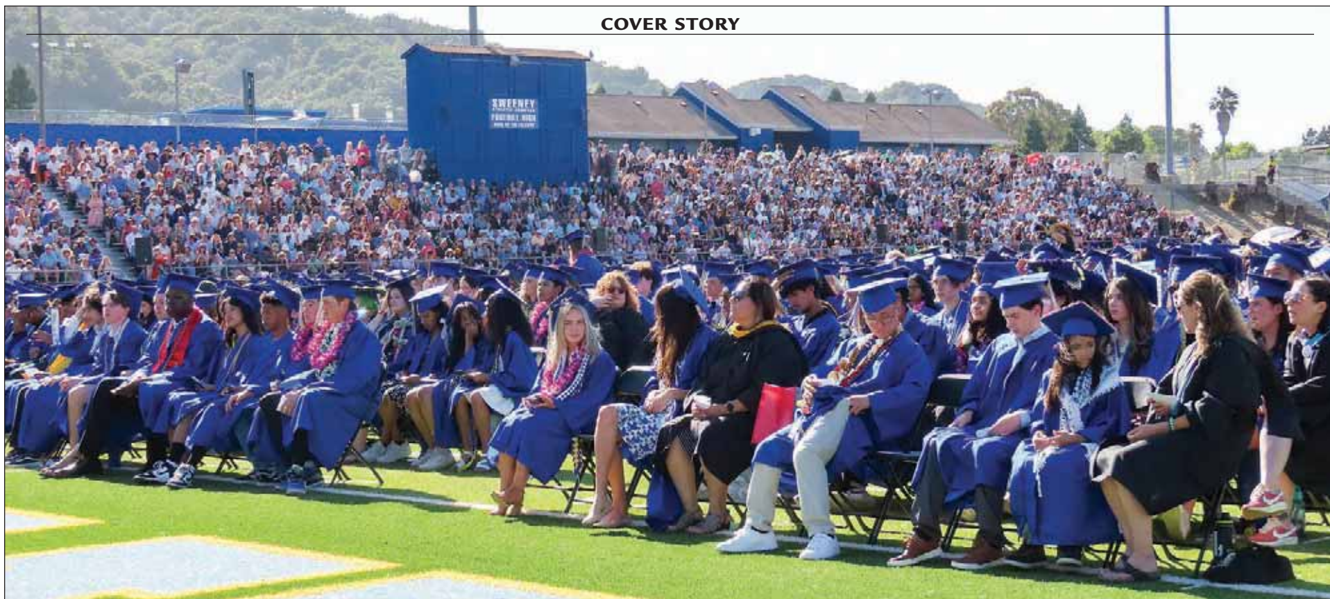
Foothill High School's graduating class of 2024 sit patiently as their peers take the stage for musical performances and speeches during the May 31 graduation ceremony at the school's football field.