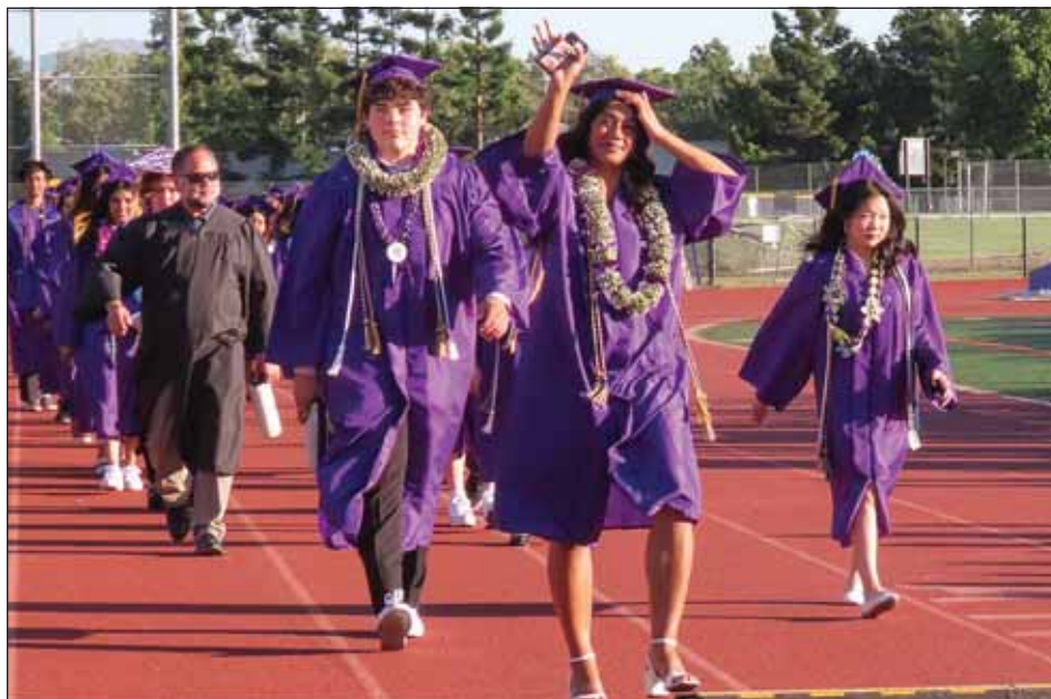
Amador Valley High School seniors wave to their families as they make their way to their seats for this year's graduation ceremony on May 31.

The Pleasanton Weekly congratulates the graduates on their success and wishes them all the best. ■