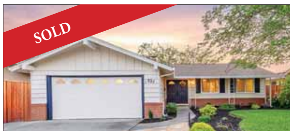
921 LAGUNA STREET, LIVERMORE 3 BD | 2 BA | 1,519 SQ. FT. | 6,500 SQ. FT. LOT SOLD FOR $1,400,000