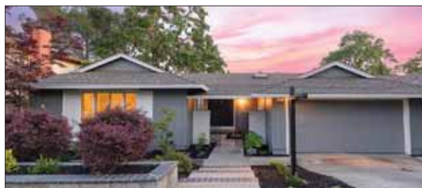
641 DEL SOL AVENUE, PLEASANTON 3 BD | 2 BA | 1,619 SQ. FT. | 6,825 SQ. FT. LOT LISTED FOR $1,699,000