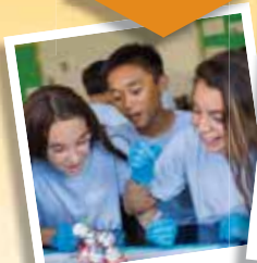
Learning and Growing