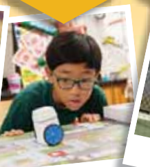
Mastering New Skills