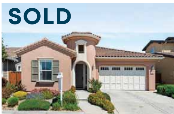
1522 CHATHAM PLACE PLEASANTON

SOLD FOR $1,600,000 | REPRESENTED SELLER