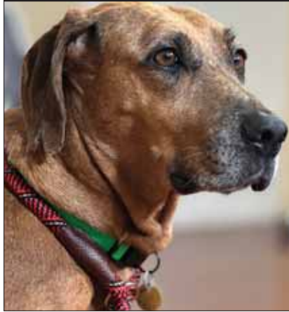
EAST BAY SPCA