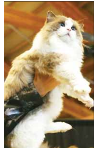
LOVING CATS WORLDWIDE

“In that one year we've produced 25 shows on four different continents. So it was obvious that the world needed this, that they were