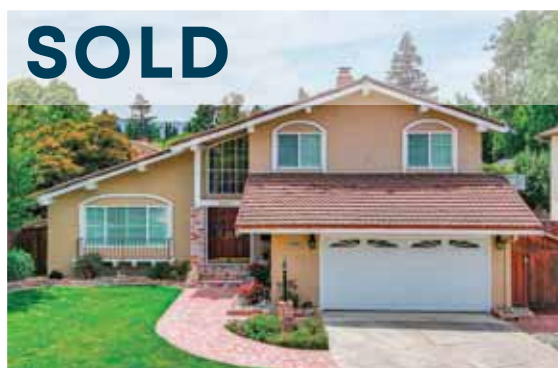
3264 PICADILLY COURT PLEASANTON

SOLD FOR $1,600,000 | REPRESENTED SELLER