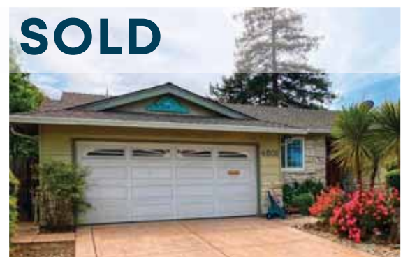
4801 WINDERMERE DRIVE NEWARK

SOLD FOR $1,650,000 | REPRESENTED SELLER