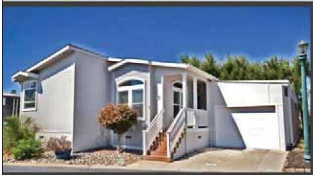
3263 VINEYARD AVE, #18 | $475,000 3 bedrooms | 2 bath | 1,860 sq ft