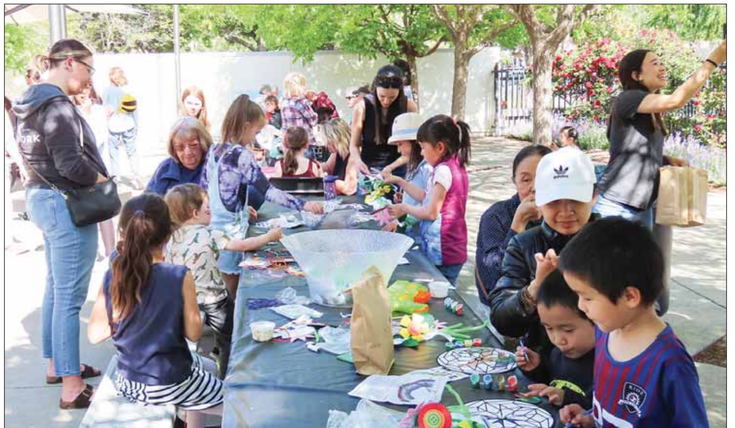
Several kids and their family members work on arts and crafts during the second annual Party on the Patio event hosted by the Pleasanton Senior Center on May 11.

The Party on the Patio on May 11 was put together by the city's recreation department and the Friends of Pleasanton Senior Center nonprofit organization as a way to celebrate