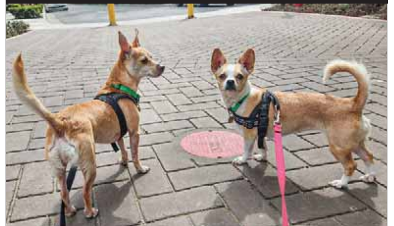
EAST BAY SPCA