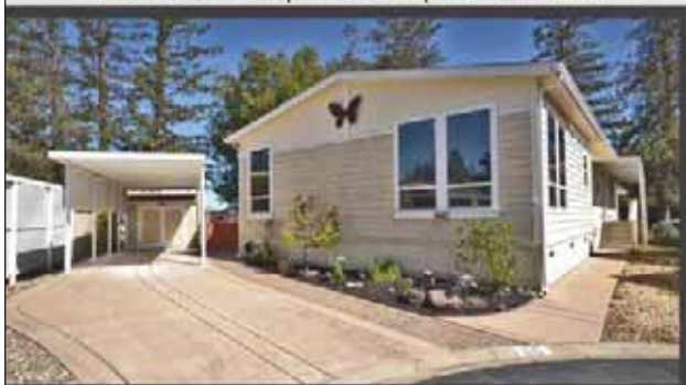
3231 VINEYARD AVE, #60 | $415,000 3 bedrooms | 2 bath | 1,620 sq ft