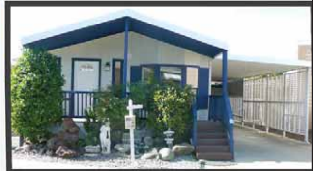
3263 VINEYARD AVE, #192 | $239,000 2 bedrooms | 2 bath | 1,040 sq ft