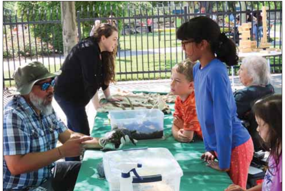
One of the main attractions at the event was the Alviso Adobe Community Community Park petting station where kids and seniors alike were able to pet Frankie the turtle and see a live snake along with real animal furs.

But more importantly, she said it was a great way for the seniors — who live around