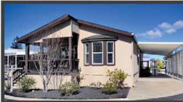
3263 VINEYARD AVE, #90 | $315,000 3 bedrooms | 2 bath | 1,380 sq ft