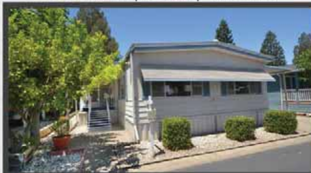
3231 VINEYARD AVE, #77 | $175,000 2 bedrooms | 2 bath | 1,440 sq ft