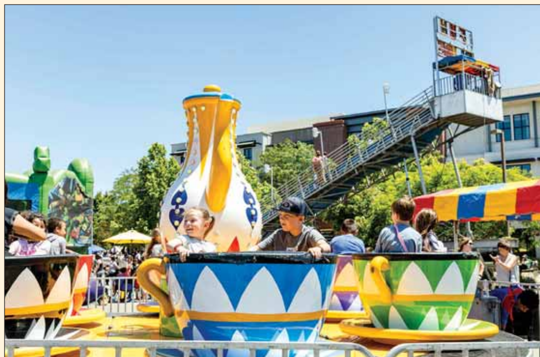
The annual Livermore Downtown Street Fest returns this weekend with activities for the whole family.