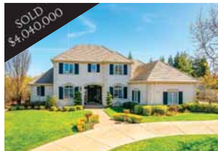
3218 NOVARA WAY, RUBY HILL REPRESENTED SELLERS & BUYERS