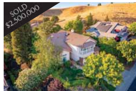
4854 BRAXTON PLACE, PLEASANTON REPRESENTED SELLERS & BUYERS