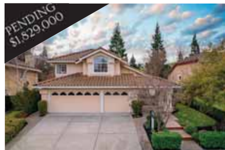
66 EDGEGATE COURT, DANVILLE REPRESENTING SELLERS