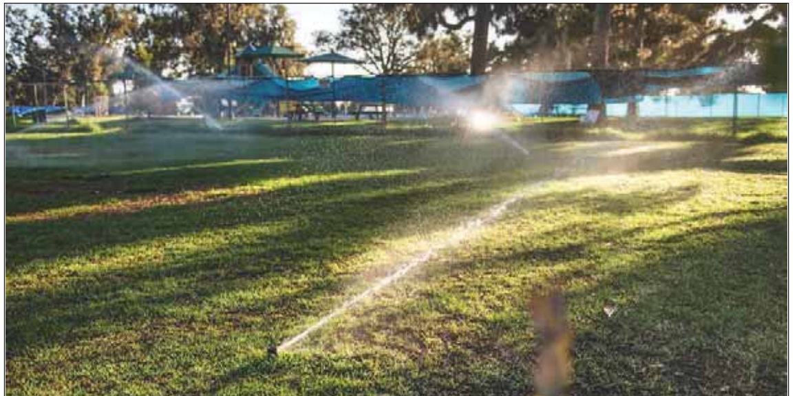
Sprinklers water a lawn in Los Angeles on June 5, 2022.

"Not massive accumulations, but could be locally heavy," he said. ■