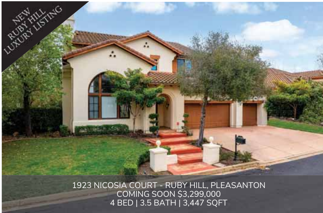
1923 NICOSIA COURT - RUBY HILL, PLEASANTON COMING SOON $3,299,000 4 BED | 3.5 BATH | 3,447 SQFT