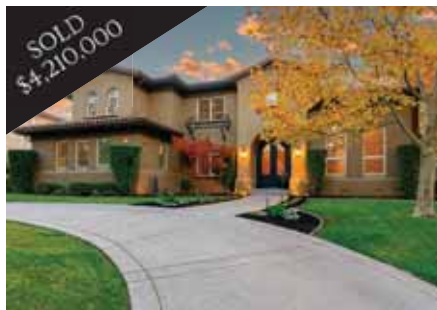
3839 ANTONINI WAY, RUBY HILL REPRESENTED SELLERS

Schedule private showing: (925) 302-2626 | Info@Armariohomes.com