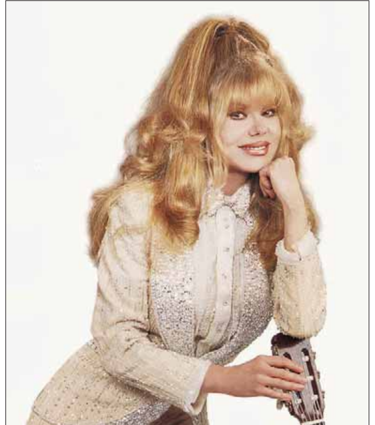
LIVERMORE VALLEY ARTS