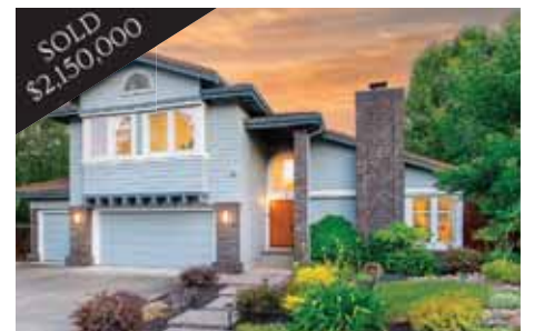
5174 MOUNT TAM CIRCLE, PLEASANTON REPRESENTED SELLERS