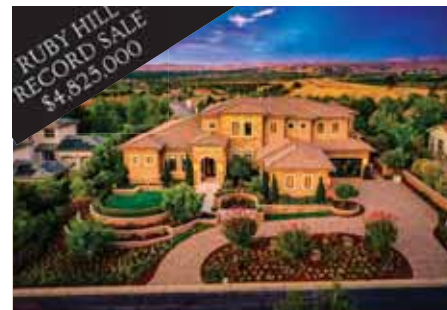
4132 PARMA COURT, RUBY HILL REPRESENTED SELLERS