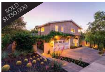
4471 LINDA WAY, PLEASANTON REPRESENTED SELLERS