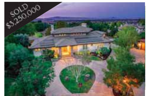
885 BRICCO COURT, RUBY HILL REPRESENTED SELLERS