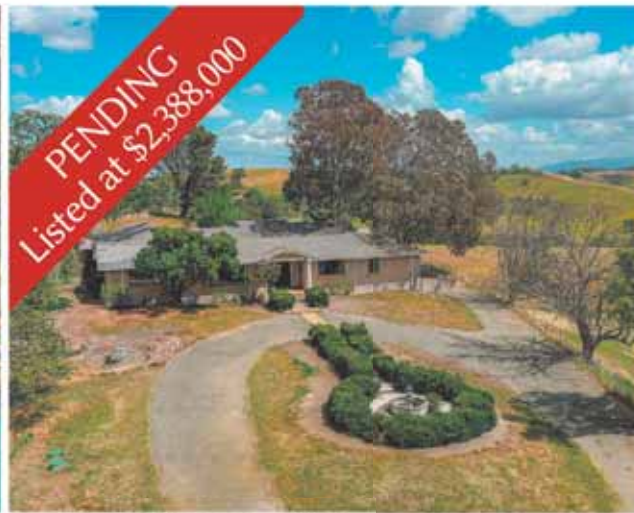
5920 Old School Road, San Ramon 5 Bedrooms | 2 Full/4 Half Bathrooms | 5,060 Square Feet