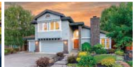
5174 MOUNT TAM CIR, PLEASANTON SOLD $2,150,000