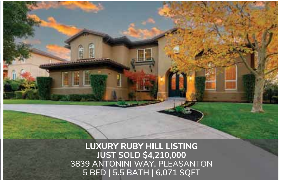
LUXURY RUBY HILL LISTING JUST SOLD $4,210,000 3839 ANTONINI WAY, PLEASANTON 5 BED | 5.5 BATH | 6,071 SQFT