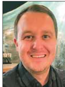
Bryce Lombardi Construction

I visited Serengeti National Park during the Great Migration. I saw lions, zebras, buffalo and crocodiles. It was absolutely thrilling. But seeing animals getting killed by other animals was very unpleasant, and something I never want to witness again. Nature is not kind, which is why human beings need to be kind to one another, regardless of the differences between and among us.