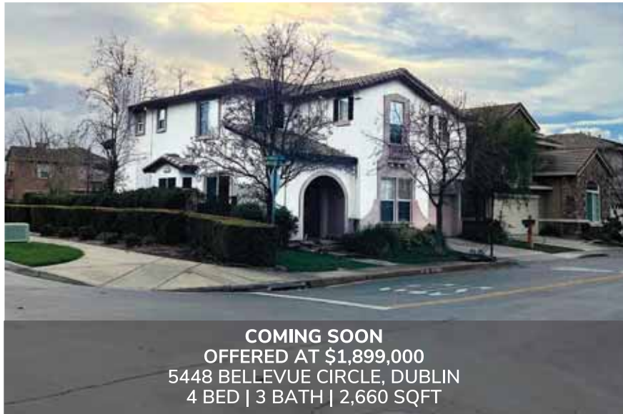
COMING SOON OFFERED AT $1,899,000 5448 BELLEVUE CIRCLE, DUBLIN 4 BED | 3 BATH | 2,660 SQFT