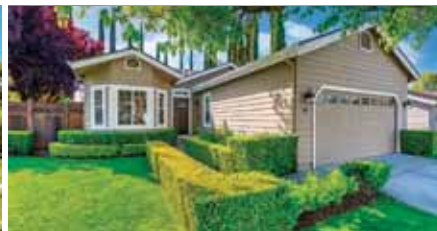
967 CLINTON PL, PLEASANTON SOLD $1,500,000