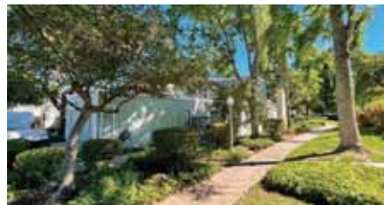
7368 STONEDALE DR, PLEASANTON SOLD $950,000