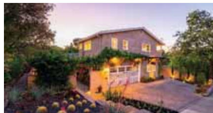
4471 LINDA WAY, PLEASANTON SOLD $1,750,000