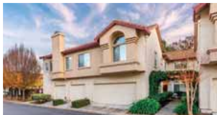
5705 BELLEZA DR, PLEASANTON NOW PENDING $999,000