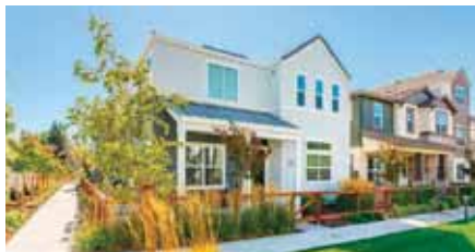
3803 ROBBY CT, PLEASANTON SOLD $1,590,000