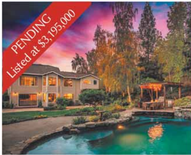
7959 Foothill Knolls Drive, Pleasanton 5 Bedrooms | 3 Bathrooms | 3,399 Square Feet

Buyers are out now looking to purchase. If sellers are thinking about waiting until Spring to sell, they should think again. Now is the time to list your home, it is better to be one of the few versus one of the many. Less home inventory means more active buyers for your home. Call us, we will happily walk you through the process. We are a wealth of free information!