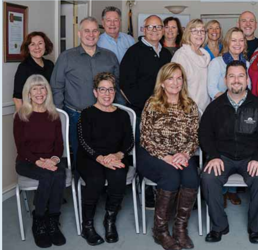
The Pleasanton Chamber's Ambassador committee, pictured at the January monthly meeting, serves the community as a whole.

Pleasanton Chamber of Commerce Advancing the economic well-being of the community