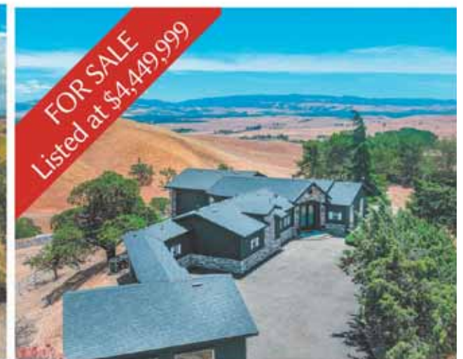
12400 Morgan Territory, Livermore 5 Bedrooms | 5.5 Bathrooms | 5,992 Square Feet