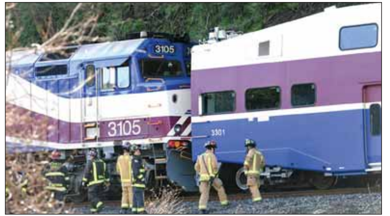
ACFD Landslide stalls ACE train near Sunol on Tuesday morning. A similar problem would occur the next day too.