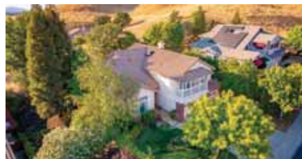
4854 BRAXTON PL, PLEASANTON SOLD $2,500,000