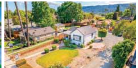
1038 DIVISION ST, PLEASANTON SOLD $1,600,000

TRI-VALLEY REAL ESTATE SERVICES: (925) 302-2626