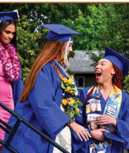
The graduation brought out the joy for Foothill seniors and their families alike.