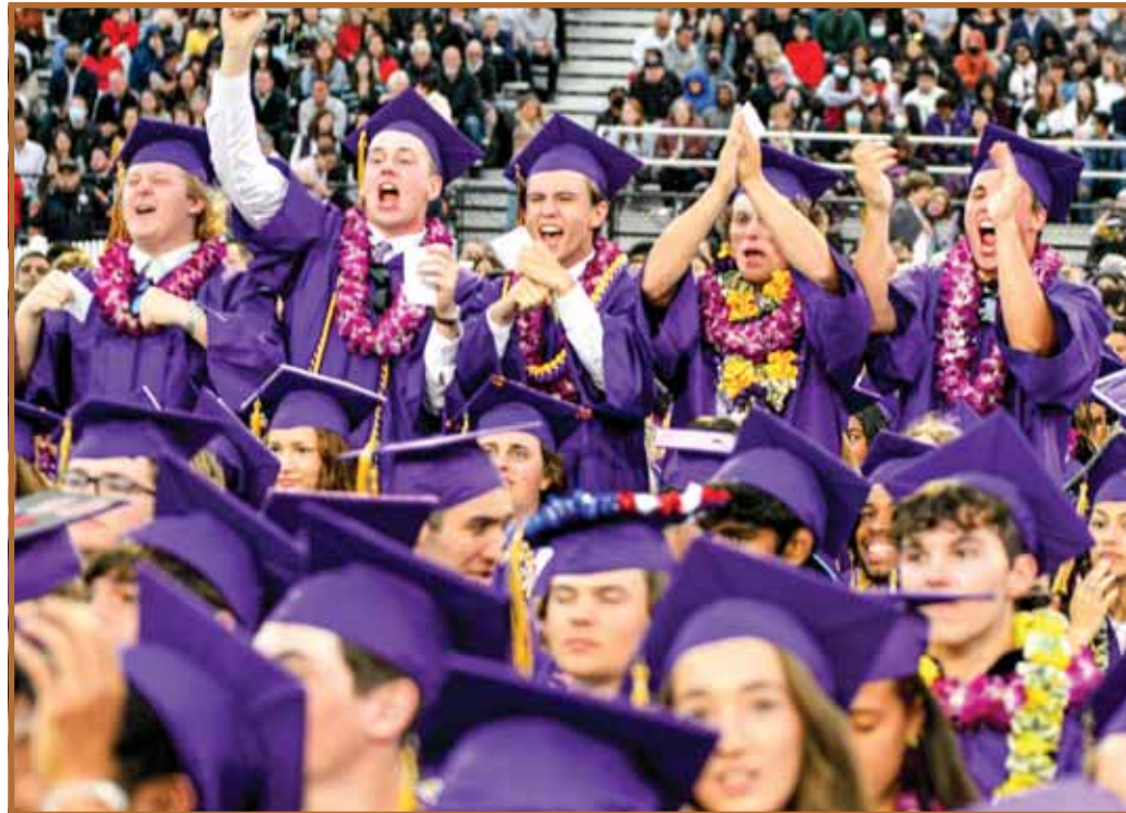
Foothill (left) and Amador Valley (right) high schools held graduation ceremonies at their respective football stadiums on June 3.