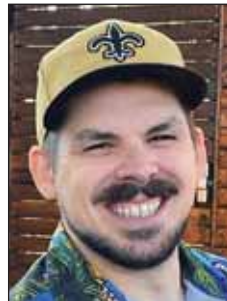
Garrett Kelly Construction

We'll probably walk downtown, see where our feet take us and enjoy a totally unplanned, spur-of-the-moment great Father's Day meal in downtown Pleasanton. I can't imagine a special plan better than that.