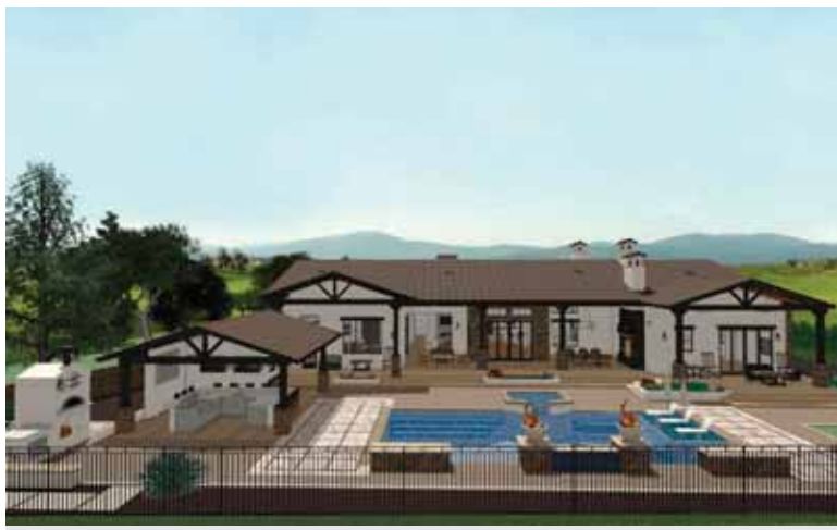
6356 INSPIRATION TERRACE ▲ $6,750,000 PLEASANTON NEW CONSTRUCTION | 6,681 +/- SQ. FT.