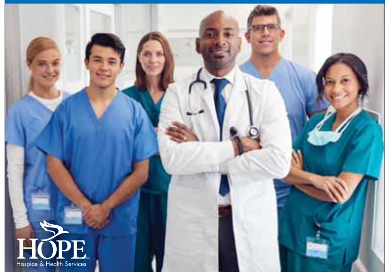
HOPE Hospice & Health Services