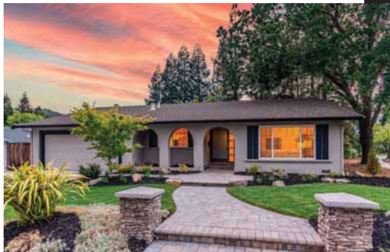
5092 HILLCREST WAY ▲ SOLD AT $1,899,000 PLEASANTON 4 BED | 2 BATH | 2,201 +/- SQ. FT.