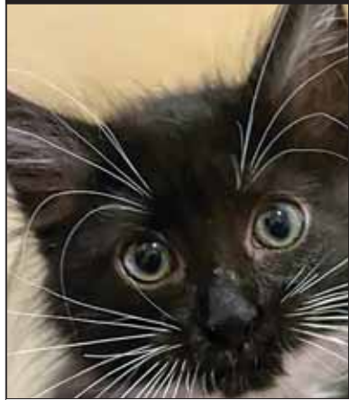
VALLEY HUMANE SOCIETY