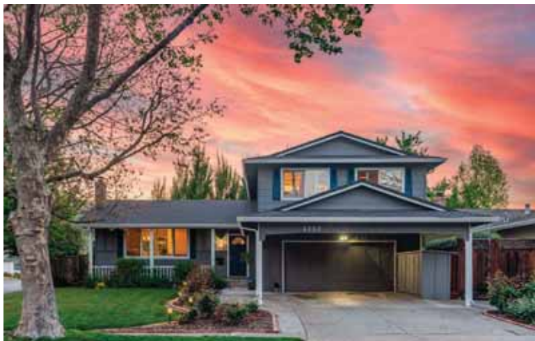
4302 MUIRWOOD DRIVE ▲ SOLD AT $1,650,000 PLEASANTON 4 BED | 2.5 BATH | 1,948 +/- SQ. FT.