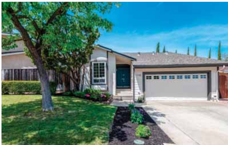
7795 OLIVE DRIVE ▲ SOLD AT $1,858,000 PLEASANTON 4 BED | 2.5 BATH | 1,953 +/- SQ. FT.