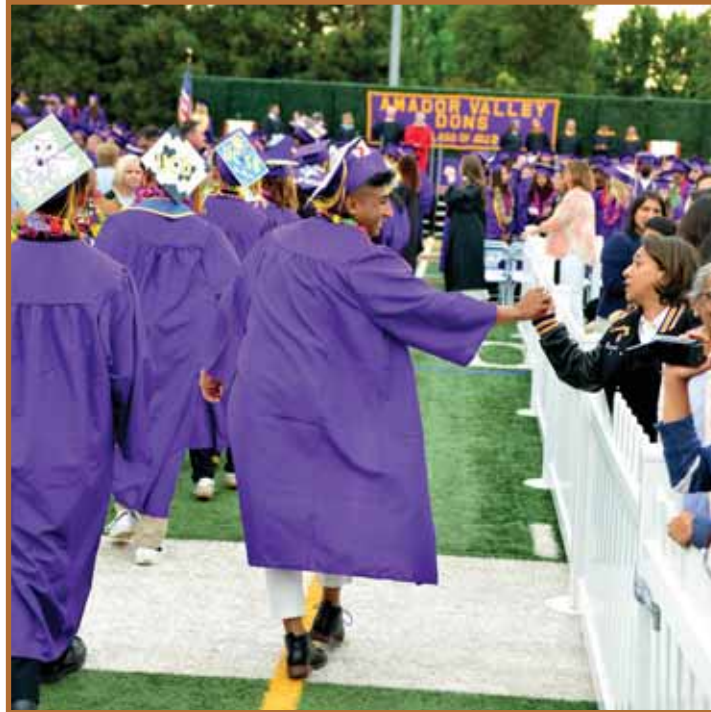
Amador Valley students filled the stadium field on June 3 for the graduation ceremony.