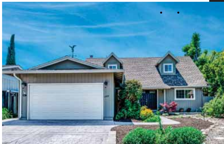
4490 SIERRA WOOD LANE ▲ $1,599,000 PLEASANTON 4 BED | 2 BATH | 1,682 +/- SQ. FT.