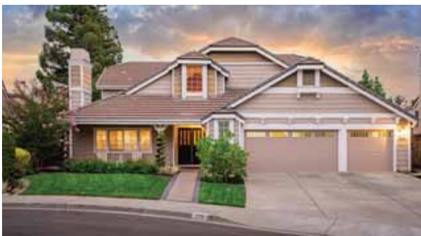
SOLD $2,370,000 530 DOLORES PLACE, PLEASANTON