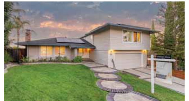
SOLD $1,880,000 1072 RIESLING DRIVE, PLEASANTON