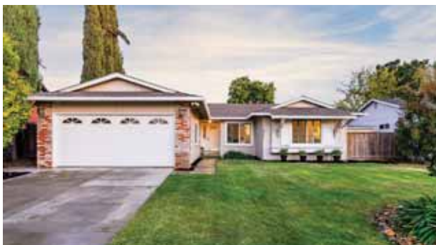
SOLD $1,175,000 473 HUNTINGTON WAY, LIVERMORE