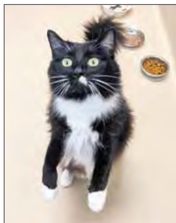
VALLEY HUMANE SOCIETY

Adoptable dogs and cats like Boo await loving families in security and comfort at Valley Humane Society's adoption center.