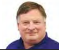
By TIM HUNT