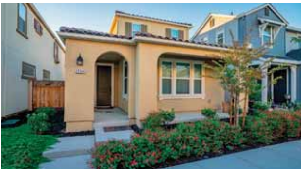
JUST LISTED $949,000 1254 S LA SERA LANE, MOUNTAIN HOUSE