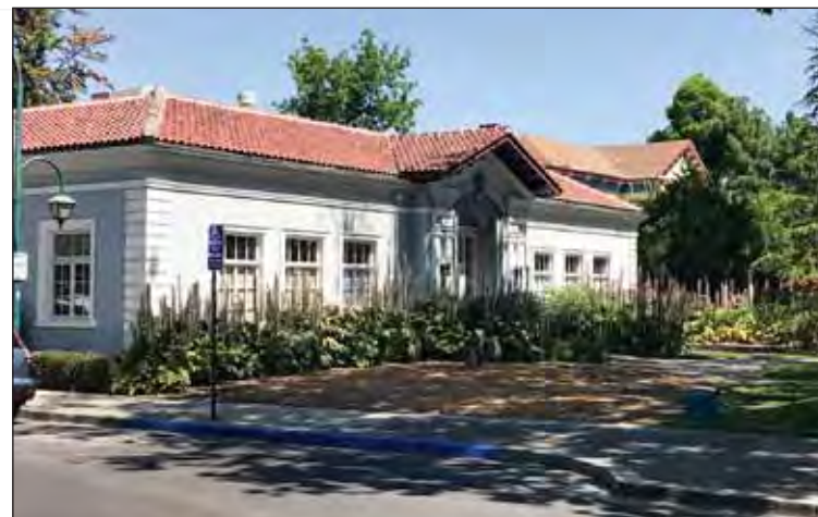
WEEKLY FILE PHOTO