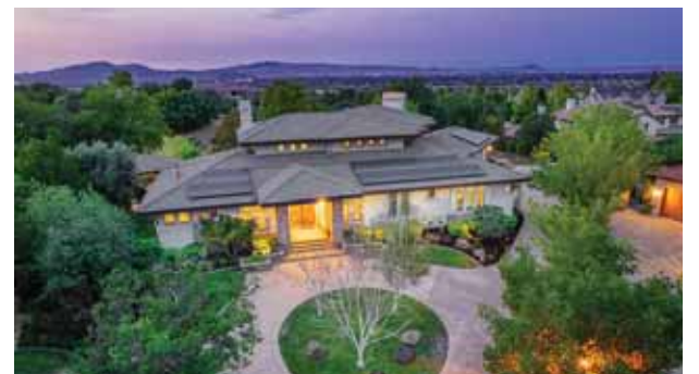
SOLD $3,250,000 885 BRICCO COURT, RUBY HILL, PLEASANTON