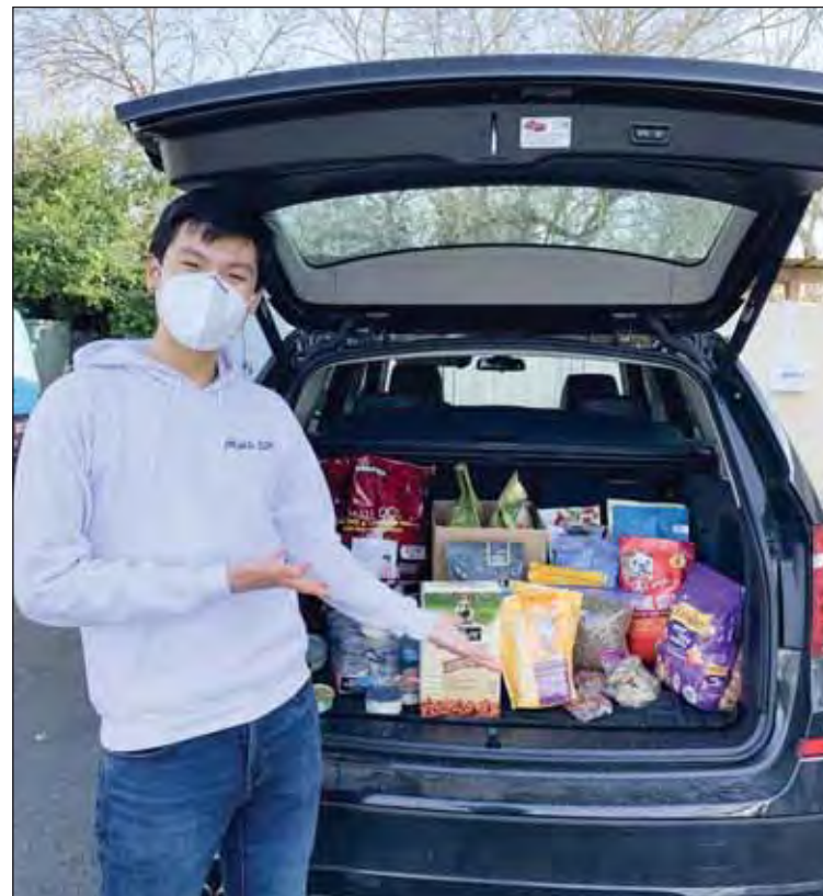
VALLEY HUMANE SOCIETY

Sunflower Hill is a Tri-Valley nonprofit with a mission of creat-