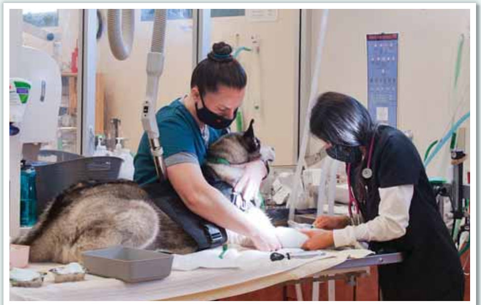
VALLEY HUMANE SOCIETY

She added, “We deeply value being a trusted nonprofit in this community, and take our fiscal responsibility as seriously as our mission. Those who support the Holiday Fund this year will be helping to make a profound difference in the lives of our community members and their beloved companions.” ■