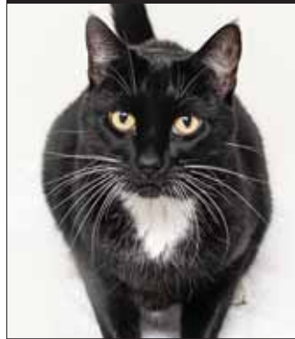
EAST BAY SPCA