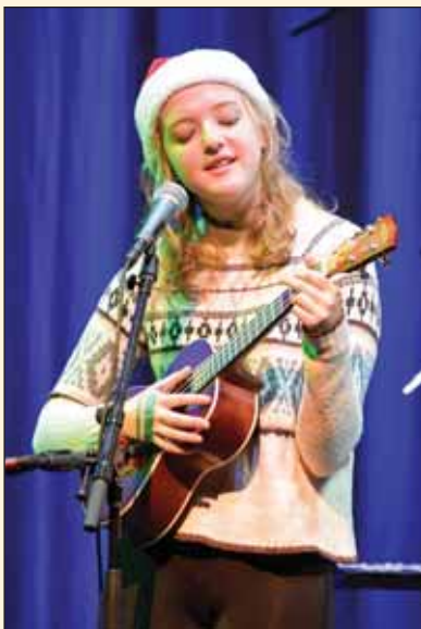
CITY OF PLEASANTON