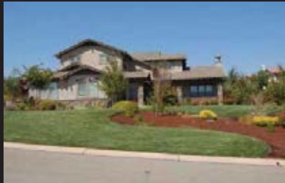
Pending $2,150,000 4340 West Ruby Hill Drive, Ruby Hill 5 BD | 3 BA | +/-27,00 sq. ft. Representing Buyer & Seller