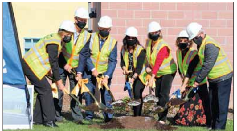
School and district officials ceremonially break ground on the first phase of the Hart Middle School science building project.

The trustees unanimously approved a $1,941,747 contract with Silicon Valley Paving Inc. for work on the project’s first phase just