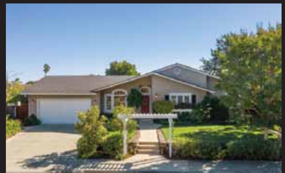
Pending $2,999,000 470 Tiller Lane, Redwood Shores 5 BD | 4 BA | +/-3,566 sq. ft.

Uwe Maerz Broker Associate 925.360.8758 uwe.maerz@compass.com DRE 01390383