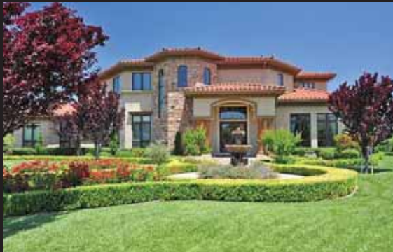
Pending $4,299,000 831 Bricco Court, Ruby Hill 6 BD | 7 BA | 10,091 sq. ft.