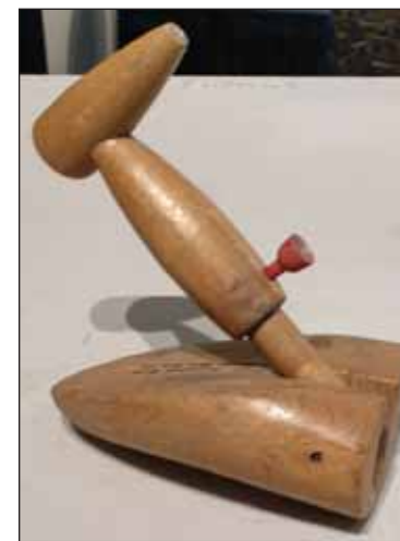
MUSEUM ON MAIN