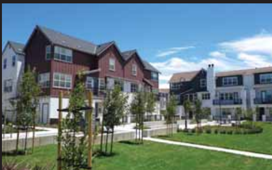
Pending $928,888 3969 Twain Harte Road, Dublin 3 BD | 3.5 BA | +/-2,002 sq. ft. Representing Buyer & Seller