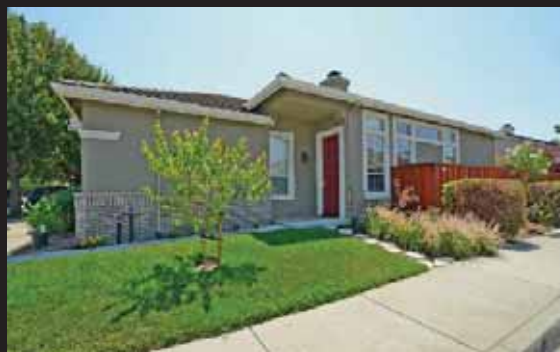
Sold $1,075,000 3803 Newton Way, Pleasanton 3 BD | 2 BA | 1,293 sq. ft. Represented Buyer & Seller