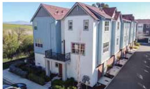
3819 Camino Loop, Dublin Pending! Multiple Offers Received, Way Over List Price.