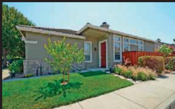
Pending (off-market) $1,075,000 3803 Newton Way, Pleasanton 3 BD | 2 BA | 1,293 sq. ft. Represented Buyer & Seller