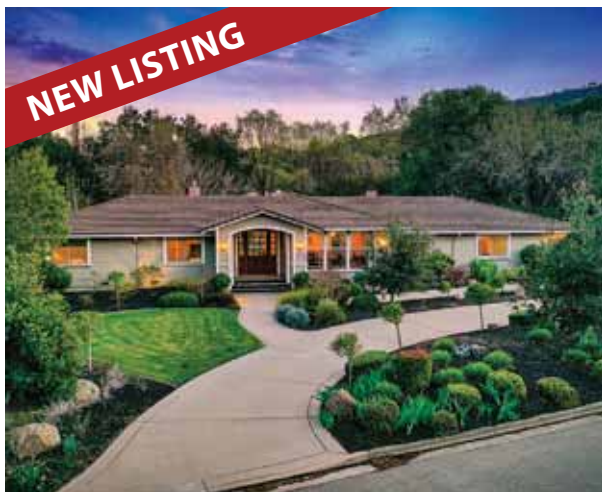
7759 Country Lane, Pleasanton Offered at $2,995,000