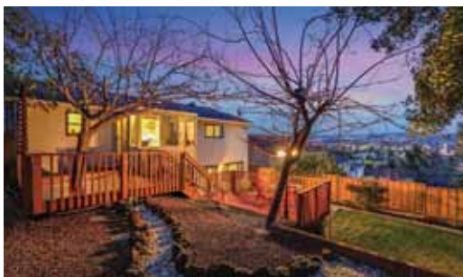
2849 Jennifer Drive, Castro Valley Pending! Over 70 Showings In 4 Days, Multiple Offers Received, Way Over List.