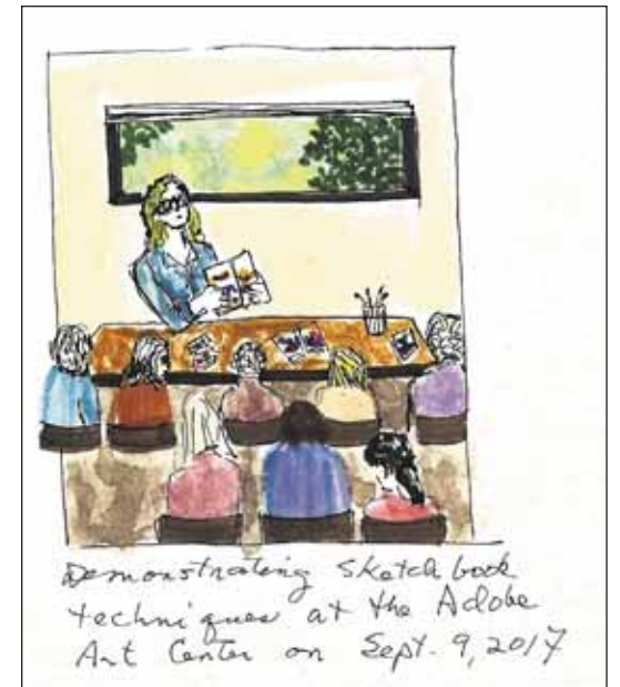
Demonstrating sketchbook techniques at the Adobe Art Center on Sept. 9, 2017