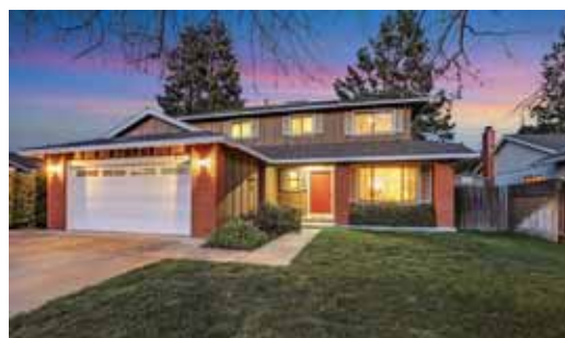
3053 Ferndale Court, Pleasanton Pending! 120 Showings In 4 Days, Multiple Offers Received, Way Over List.