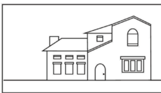
What Is Your Home Worth? Call Us Today At 925-400-7533 Or Visit BayAreaHomeFinder.com/HomeValue