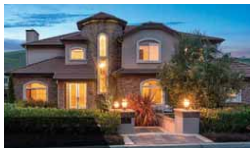
207 Lyndhurst Place, San Ramon Just Sold! 60 Showings In 6 Days | 15 Offers Received | Closed In 26 Days | Listed at $2,385,000 | Sold For $2,715,000 |