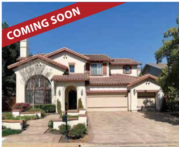
2234 Doccia Court, Ruby Hill Price Upon Request