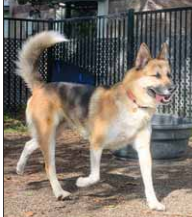
EAST BAY SPCA