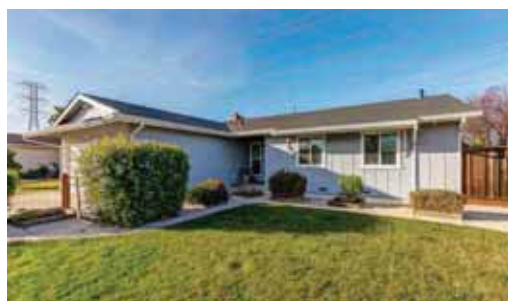
3665 Norfolk Rd, Fremont Sold! 132 Showings In 7 Days | Closed In 16 Days | Listed At $1,000,000 | Sold For $1,188,888 |