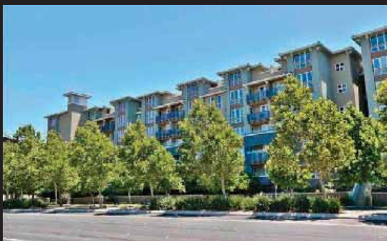
Coming Soon $728,888 5501 DeMarcus Blvd Unit # 273, Dublin 2 BD | 2 BA | 1,399 sq. ft.