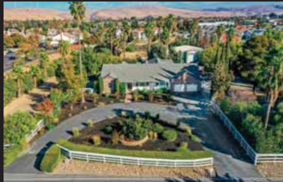
Price Reduced $2,999,999 1151 Central Avenue, Livermore 4 BD | 3 BA | 3,424 sq. ft. 2.08 acre lot & sub-dividable into 9 parcels