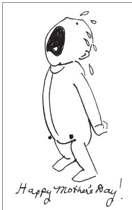
Happy Mother's Day!

"Elaine at Her Desk" and "Elaine Teaching a Class" are two illustrations by Elaine Drew from an exercise to illustrate her day in drawings.