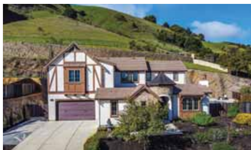
3209 Ashbourne Circle, San Ramon Coming Soon! 5BD, 4.5BA, 4,000SF | Call 925-400-7533 For Details

Who you hire does matter, the difference in proceeds could be $50-100K. What would you do with that extra cash in your pocket? Call Us Today at 925-400-7533!