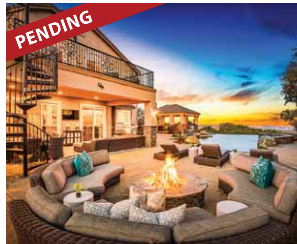
9472 Blessing Drive Offered at $4,850,000