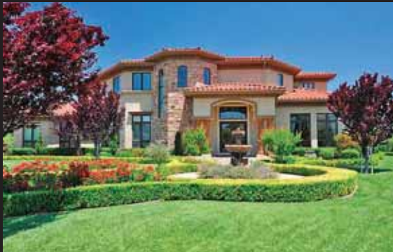
Active $4,299,000 831 Bricco Court, Ruby Hill 6 BD | 7 BA | 10,091 sq. ft.