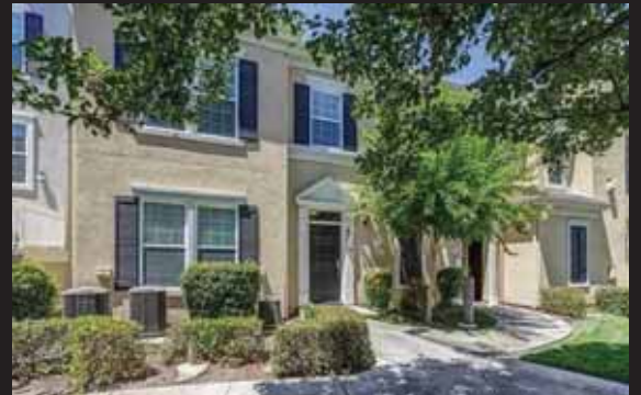
Pending $998,888 3602 Whitworth Drive, Dublin 3 BD | 2BA | 2,156 sq. ft.