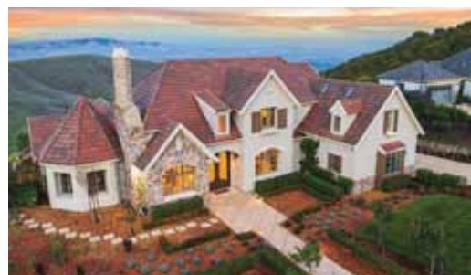
1087 Hawkshead Circle, San Ramon Just Sold! 67 Showings In 5 Days | 13 Offers Received, Closed in 27 Days! | Highest Resale Price EVER In San Ramon! | Sold For $3,210,000 |