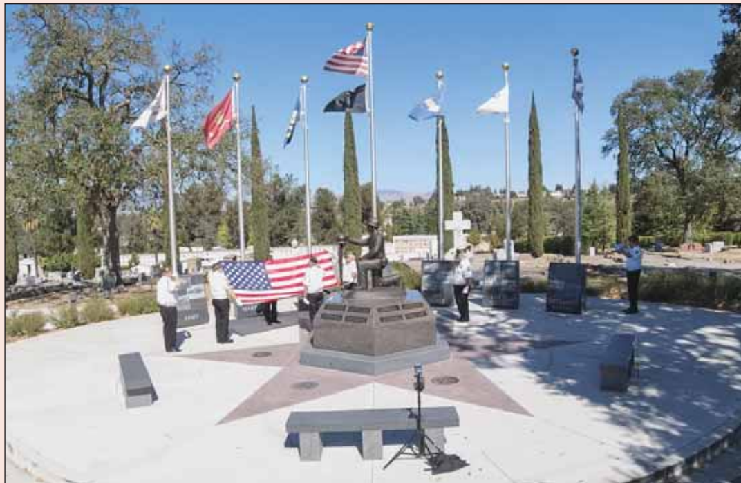
Screenshot of drone video footage from the flag-folding ceremony recorded as part of TV30's "Spotlight on Veterans" program.