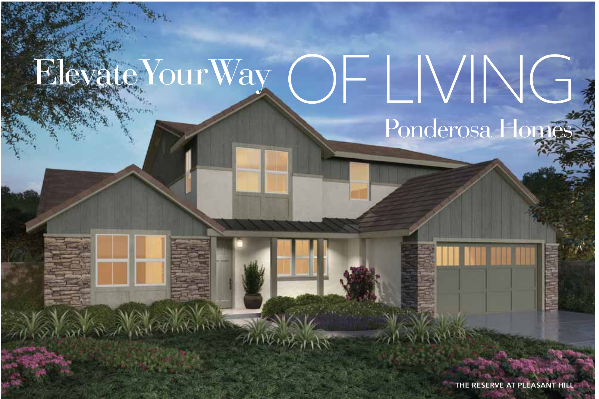
THE RESERVE AT PLEASANT HILL

Discover a home that transcends imagination. With expansive floor plans and highly sought-after features, the luxurious residences by Ponderosa Homes across the Bay Area and Southern California invite you to live the way you've always envisioned.