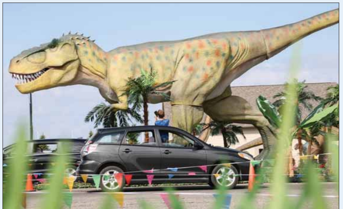
PINNACLE PRODUCTION GROUP