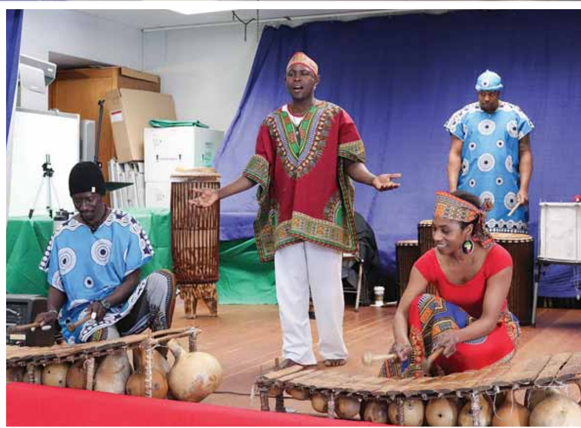
With Cheza Nami, artists are given the opportunity to showcase their cultural heritage on the stage, sharing their passions with the community and preserving their cultural traditions.

Residents can learn more about the Cheza Nami Foundation and track upcoming events online at www.chezanami.org . ■