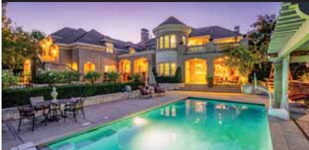
3242 Novara Way, Ruby Hill 5BR, 5BA, 6997+/- Sq. Ft. Offered at $3,449,888