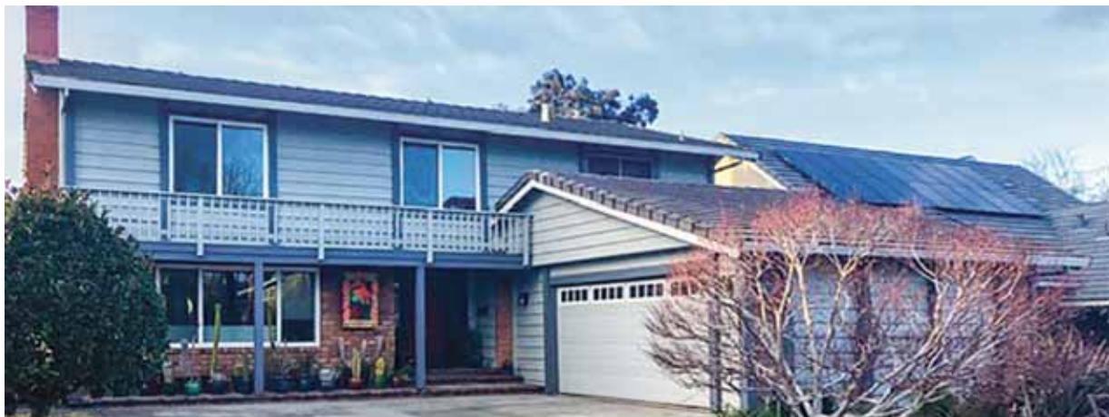
5553 Corte Sonora Ct., Pleasanton Open House: Sat 1-4; Sun 1-4

A Grand presence in the Prestigious Ruby Hill gated community. This absolutely stunning 6 bed, 5.5 bath Estate offers 5,881 SF of living space & 20,255 SF lot. A full bedroom/bath downstairs, along with an additional bedroom/office. OWNED SOLAR. A private backyard with a detached covered portico & expansive hillside views are additional features of this court located home. $2,880,000