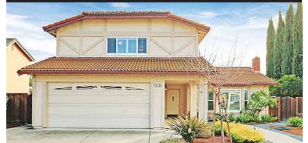
3618 Dunsmuir Circle, Pleasanton 4BR, 2.5BA, 2142+/- Sq. Ft. Offered at $1,149,000