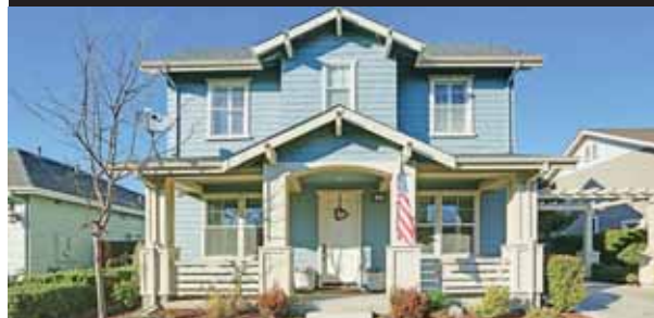
1373 Buckhorn Creek Road, Livermore 3BR, 2.5BA, 2578+/- Sq. Ft. Offered at $1,195,000