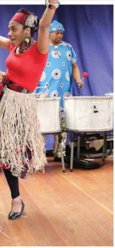
Elementary School in Hayward holds its A Taste of Africa festival

History Month has schools and community members feeling particularly interested in learning about cultural diversity.