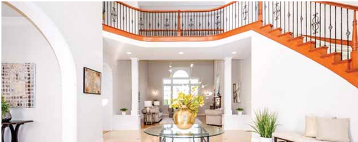
Ruby Hill – 3618 Pontina Court, Pleasanton Open House: Sat 1-4; Sun 1-4

A Grand presence in the Prestigious Ruby Hill gated community. This absolutely stunning 6 bed, 5.5 bath Estate offers 5,881 SF of living space & 20,255 SF lot. A full bedroom/bath downstairs, along with an additional bedroom/office. OWNED SOLAR. A private backyard with a detached covered portico & expansive hillside views are additional features of this court located home. $2,880,000