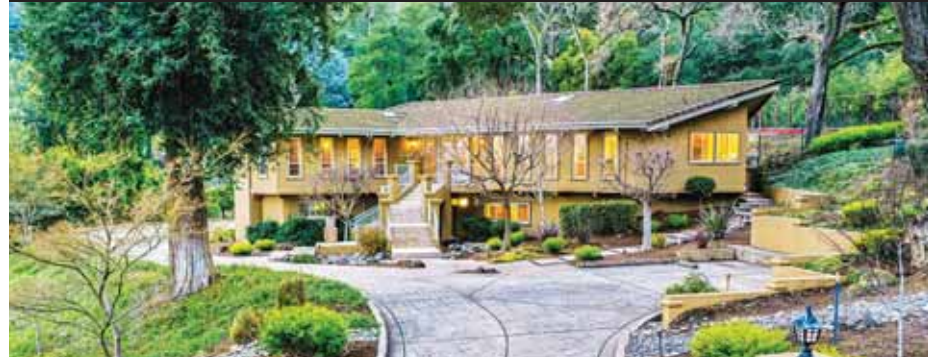
53 Golf Road, Pleasanton 5BR, 3.5BA, 4970+/- Sq. Ft. Offered at $1,995,000