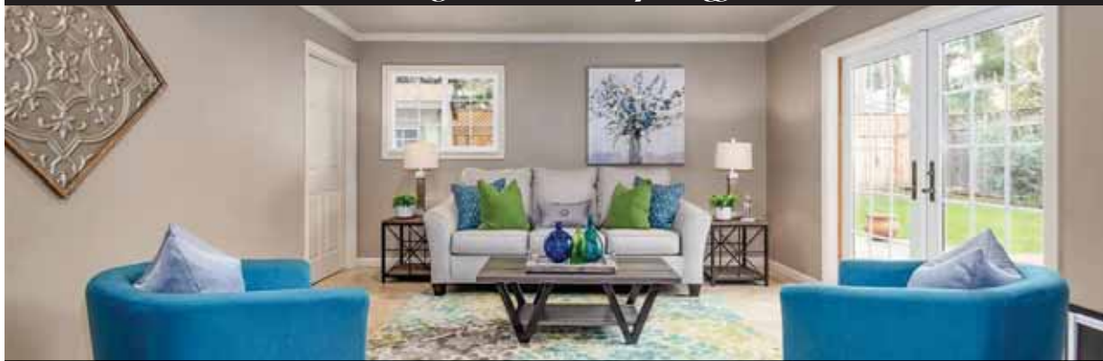
3636 Camelot Court, Pleasanton

This 4 bed, 3 bath home was built in 1970. The expanded home offers an expansive master bedroom with walk in closet. There is a bedroom and full bath on main level. Step down into the family room with additional custom cabinetry and access to the rear yard & outdoor kitchen. $1,189,000