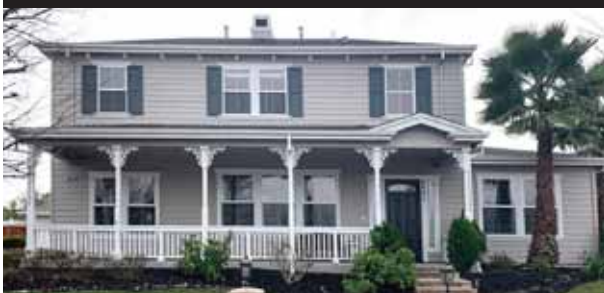
2407 Belmont Drive, Livermore 4BR, 4BA, 3482+/- Sq. Ft. Call for Pricing