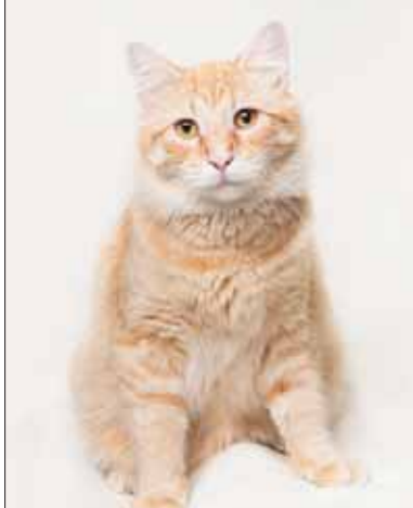
EAST BAY SPCA