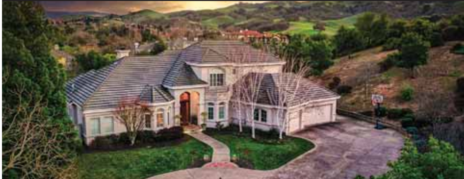
2792 Spotorno Court, Ruby Hill 4BR, 3.5BA, 4688+/- Sq. Ft. Call for Pricing