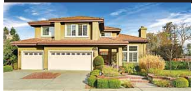
5011 Forest Hill Drive, Pleasanton 5BR, 3BA, 3430+/- Sq. Ft. $1,950,000