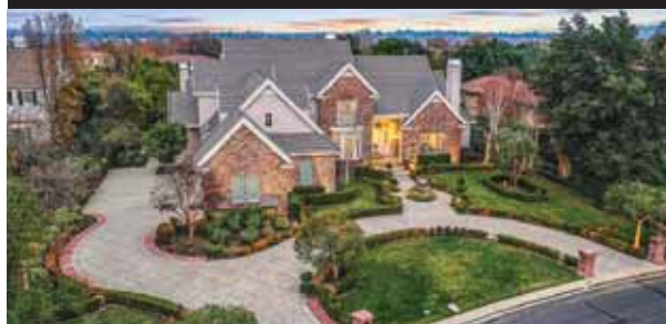
1089 Via Di Salerno, Ruby Hill 5BR, 5.5BA, 6059+/- Sq. Ft. $2,750,00