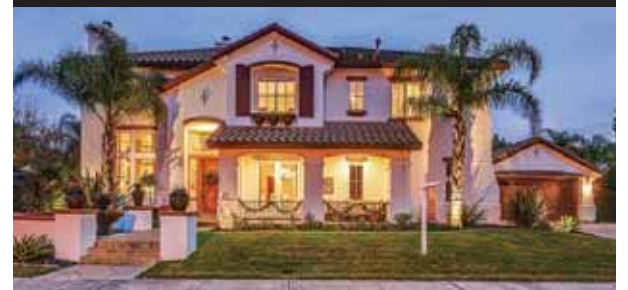
1576 Prima Drive, Livermore 5BR, 3.5BA, 3532+/- Sq. Ft. $1,389,000