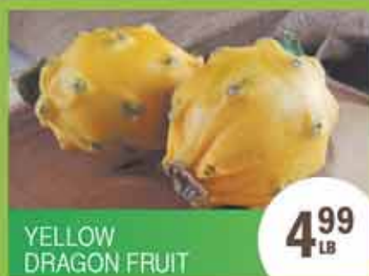
YELLOW DRAGON FRUIT