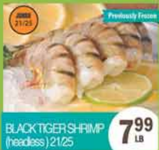
BLACK TIGER SHRIMP (headless) 21/25