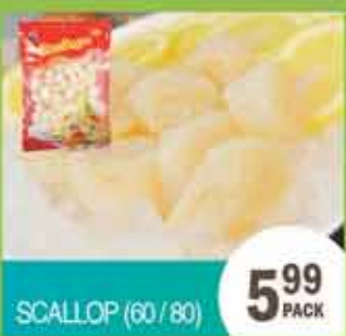
SCALLOP (60 / 80)