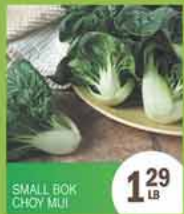
SMALL BOK CHOY MUI