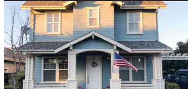
1373 Buckhorn Creek Road, Livermore 4BR, 2.5BA, 2578+/- Sq. Ft. Call for Pricing