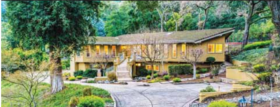
53 Golf Road, Pleasanton 5BR, 3.5BA, 4970+/- Sq. Ft. Offered at $1,995,000