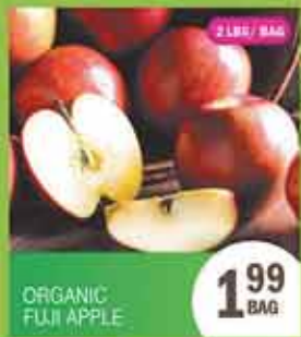
ORGANIC FUJI APPLE