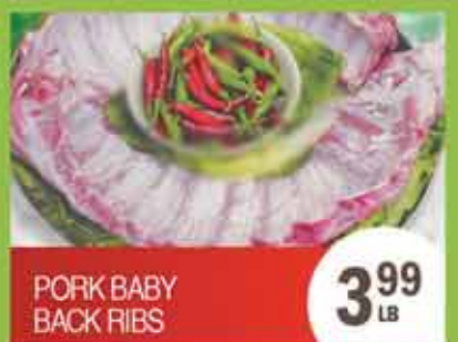
PORK BABY BACK RIBS