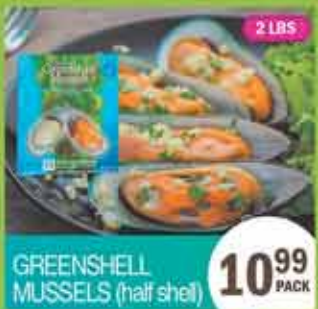
GREENSHELL MUSSELS (half shell)