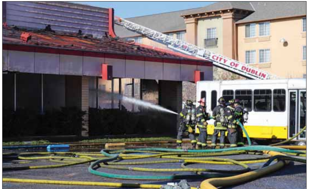
RYAN J. DEGAN

Firefighters work to knock down flames that broke out inside the vacant restaurant building on Owens Drive near Hopyard Road on Tuesday morning.