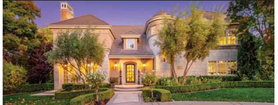
3242 Novara Way, Ruby Hill 5BR, 5BA, 6997+/- Sq. Ft. Offered at $3,449,888