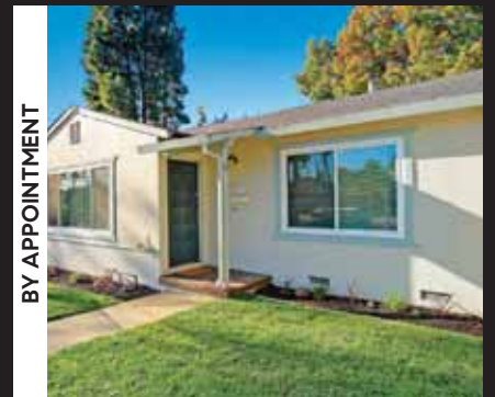
1652 Pine Street, Livermore 2 Bed | 1 Bath | $569,990

Mike D'Onofrio 925.583.1107 DRE 01110896