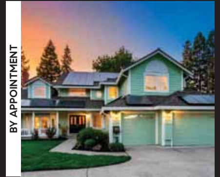
3611 Cameron Avenue, Pleasanton 4 Bed | 3 Bath | $2,050,000