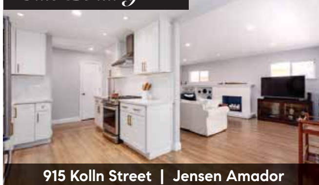
915 Kolln Street | Jensen Amador

Downtown Pleasanton is just within reach in this desirable Jensen/Amador neighborhood. A 3 bed, 2 bath home with wood floors & a spacious open floor plan. Completely updated, ready to move in, and no rear neighbors. $1,158,000.