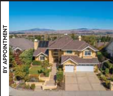
2839 Victoria Ridge Court, Pleasanton 5 Bed | 3 Bath | $1,695,999