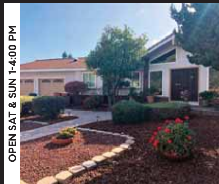
496 Adams Way, Pleasanton 4 Bed | 2.5 Bath | $1,400,900