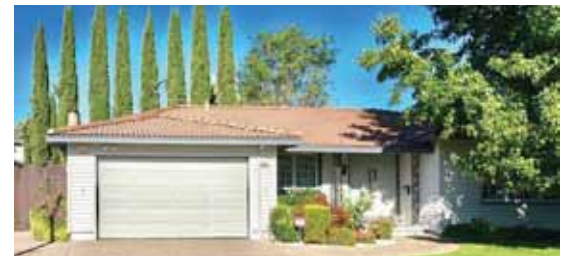
2646 Becard Court, Pleasanton 4 Bed | 2 Bath | 2,186+/- SqFt | 7,665+/- SqFt lot Offered at $1,239,000