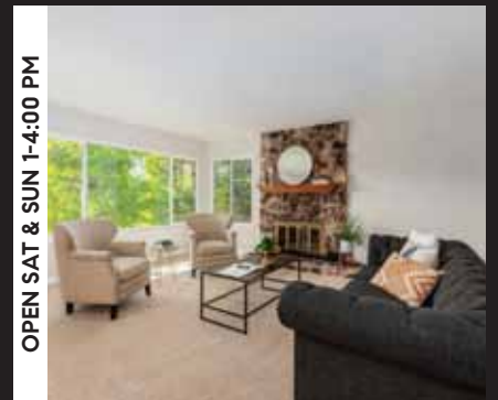
18220 Vineyard Road, Castro Valley 3 Bed | 2 Bath | $865,000