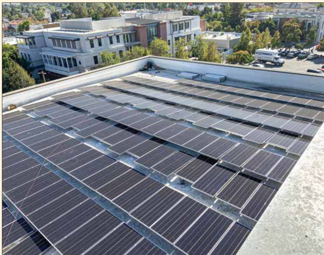
New solar panels (156 in all) were added recently on top of the Bankhead Theater in downtown Livermore.