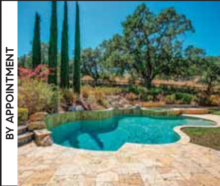
892 Chateau Heights Court, Pleasanton 5 Bed | 4.5 Bath | $2,389,000

Access thousands of new listings before anyone else, only at compass.com .