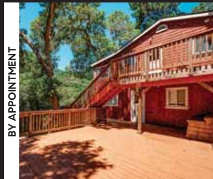
2639 Parkway, Sunol 3 Bed | 2 Bath | $799,000

Mike D'Onofrio 510.507.2550 DRE 01110896