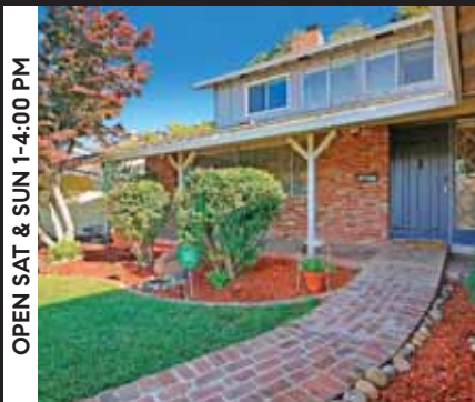
2148 Benedict Drive, San Leandro 4 Bed | 3 Bath | $864,990

Mike D'Onofrio 510.507.2550 DRE 01110896