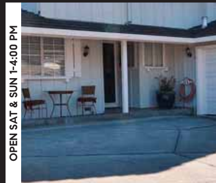
5480 Greenfield Way, Pleasanton 5 Bed | 3 Bath | $1,239,000