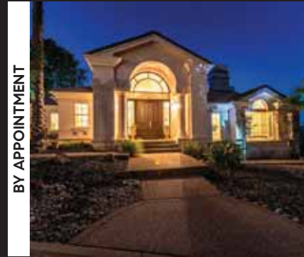
833 Castlewood Place, Pleasanton 5 Bed | 3.5 Bath | $2,095,000

Doug Buenz Judy Cheng 925.785.7777 408.849.8464 DRE 00843458 DRE 01408993