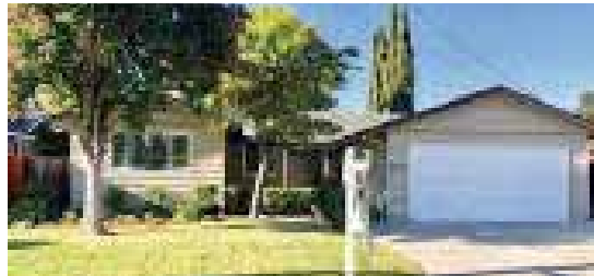
6739 Tory Way, Dublin 4 Bed | 2 Bath | 1,491+/- SqFt | 5,265+/- SqFt lot Offered at $824,900