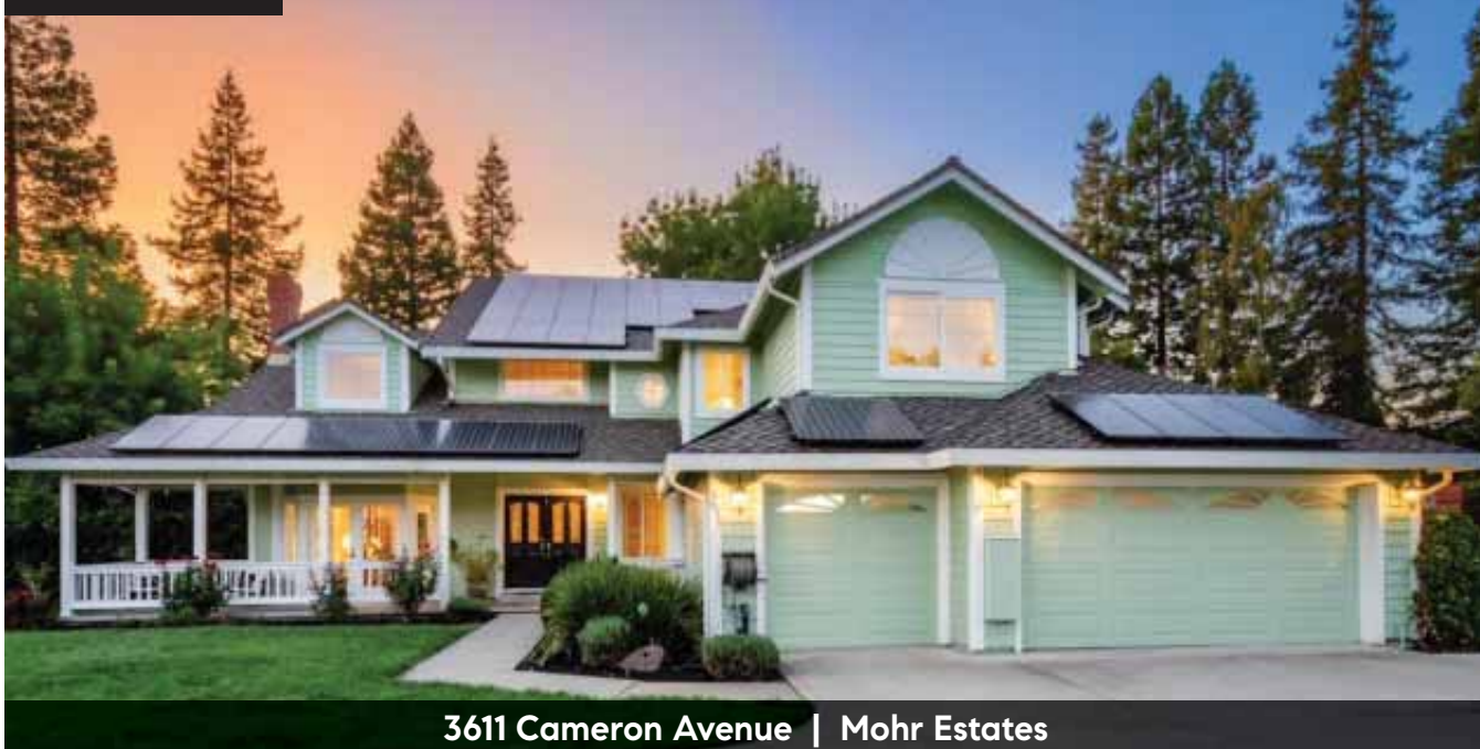
3611 Cameron Avenue | Mohr Estates

Resort-like setting in the highly sought-after Mohr Estates. This beautiful 4 bedroom, 3 bath home rests on a corner private lot nestled on almost an acre of private property. Additional features are owned solar, pool, spa, a private well for irrigation as well as city water. $2,050,000.