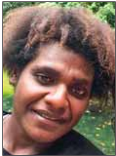
Hussein Obura College student

We didn't really do anything exciting this weekend. Just a whole lot of yard work in our own yard, and then a day of rest, and then another day of yard work at our daughter's house. It was a lovely weekend.