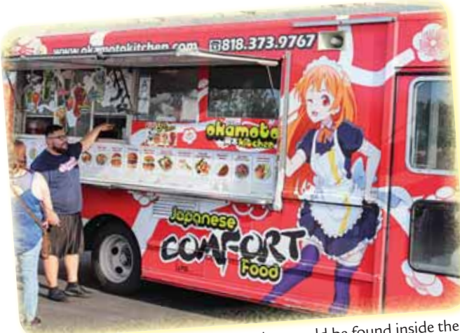
More than 100 food trucks and vendors could be found inside the market, bringing flavors from all across the world to Pleasanton.

For more information or to purchase tickets, visit www.norcalnightmarket.com . ■