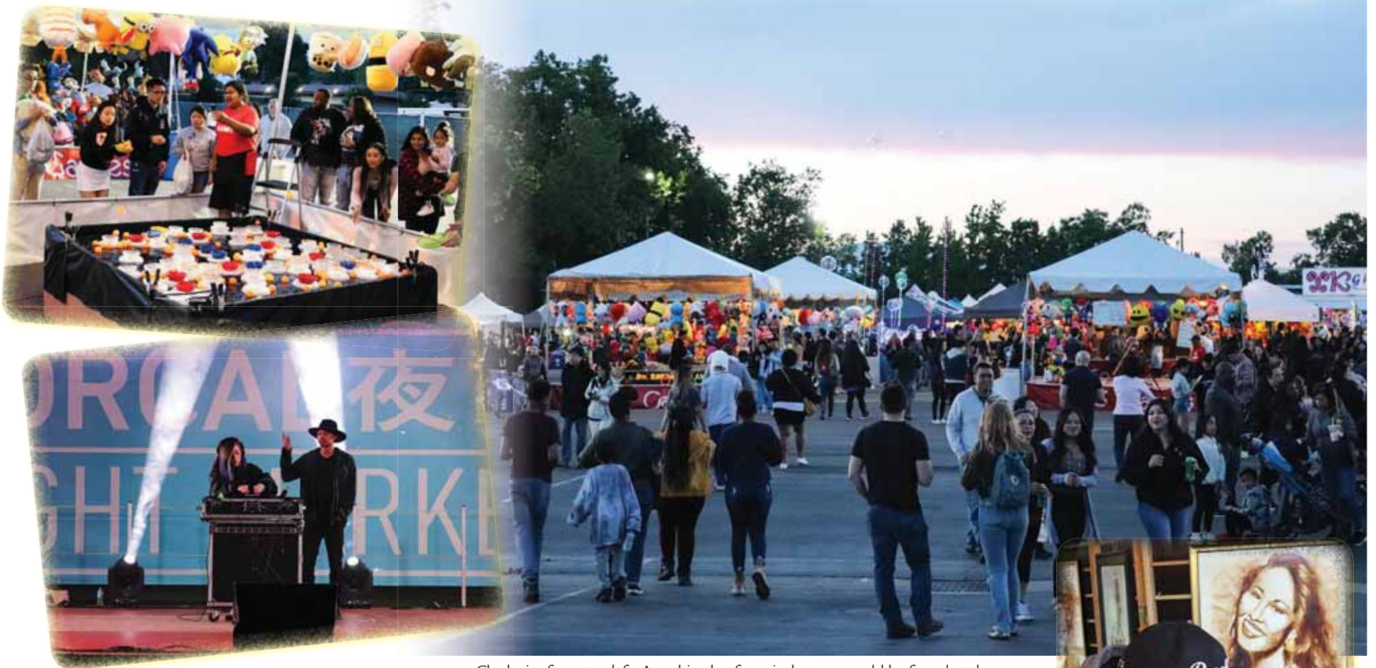
Clockwise from top left: A multitude of carnival games could be found at the NorCal Night Market, offering residents a chance to hone their skills before the county fair. Thousands of residents from across the Bay area attended the Night Market, which was held over Memorial Day weekend at the Pleasanton fairgrounds. Throughout the weekend, the market also provided various musical entertainment.