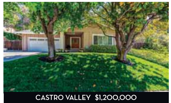
CASTRO VALLEY $1,200,000

1984 Meadow Glen Drive | 4bd/3ba Miranda Mattos | 925.336.7653 License # 01260301 OPEN SATURDAY 12:00-3:00