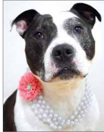
TRI-VALLEY ANIMAL RESCUE