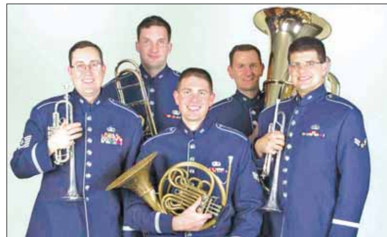
CONTRIBUTED PHOTO The Travis Brass, one of the ensembles of the U.S. Air Force Band of the Golden West.