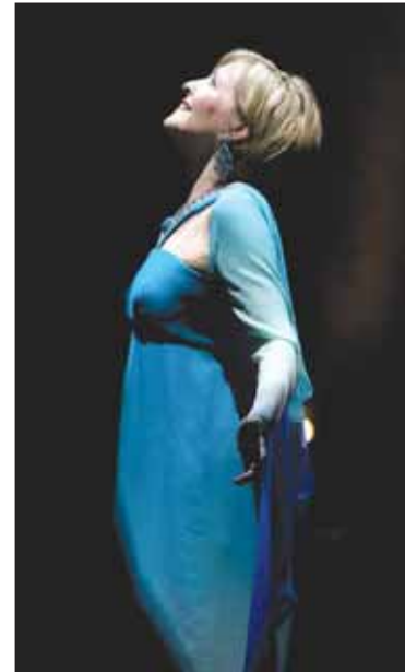
Mezzo-soprano Frederica von Stade is starring in "Three Decembers" at the Bankhead Theater later this month.

Tickets for the opera are $42-$90. Go to LVOpera.com or the Bankhead box office, 2400 First St. in Livermore, or call 373-6800. Tickets to the benefit dinner are $200, of which $100 is an LVO donation. ■