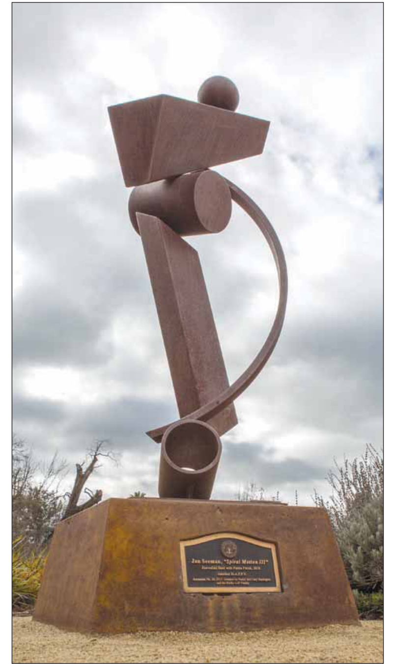
Installed in 2010, “Spiral Motion III,” by Jon Seeman, is located behind the Firehouse Arts Center.