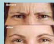
Unretouched clinical photo taken while frowning before and 14 days after treatment with Botox® Cosmetic. Individual results may vary.

Pleasanton 374 St. Mary St. (Next to Fernandos Restaurant) 925 846-5614