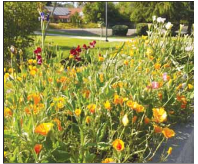
LIVERMORE AMADOR VALLEY GARDEN CLUB