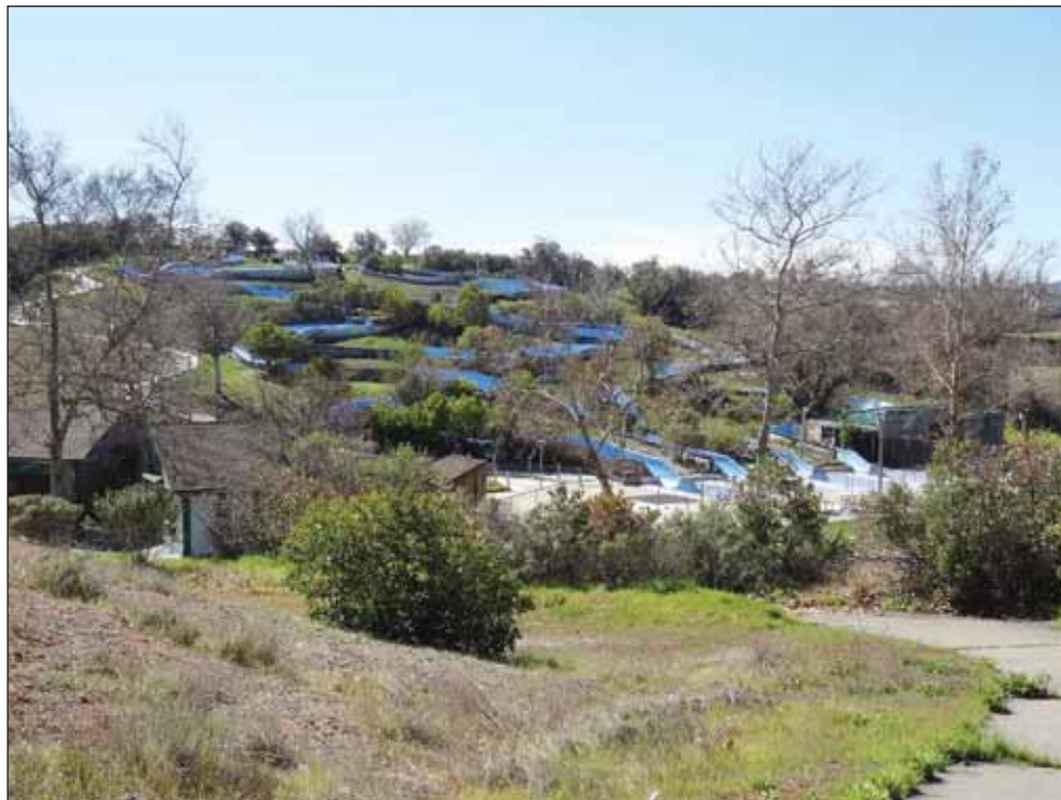
DOLORES FOX CIARDELLI

The waterslides at Shadow Cliffs were a popular feature for many decades but will now be torn down — when East Bay Regional Park District has the money.