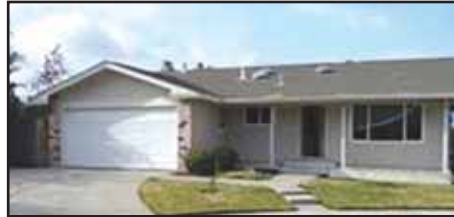
Chris Kamali & Gina Piper

7370 HILLSDALE DR – PLEASANTON – $745,000 Recently updated single story in great neighborhood. Features open floorplan, kitchen with granite counters, walk-in pantry and dual ovens. Baths totally remodeled w/top of the line features including granite, limestone and marble. Master with built-ins, wainscoting and crown molding. Backs to park.