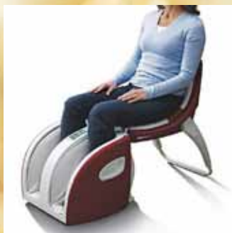
Inada Cube $799