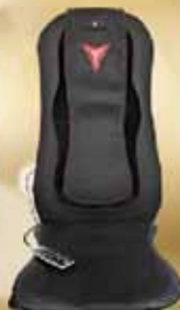
Quattromed III $299

Bring in 15 cans to support the Alameda County Food Drive and SAVE an additional