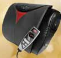
Maxiwell II $159