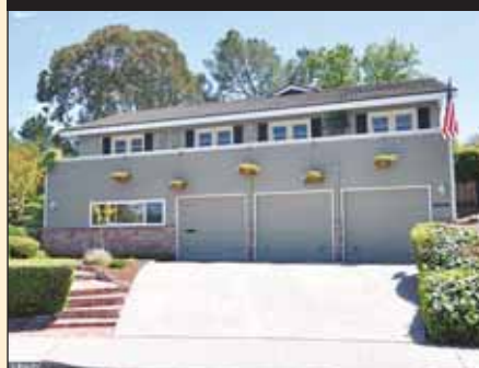
4262 TAMUR COURT, PLEASANTON Walk to downtown from your custom home. Great location at back of court and adjacent to Kottinger Park. Don't miss the large park-like private rear yard with in-ground pool, expansive decking, mature trees and beautiful landscaping. Approximately .27 acre lot. Views of Mt. Diablo. Everything is on one level, except downstairs bonus or guest suite. Four bedrooms, three baths at 2,524 square feet. Three car garage. Optional sauna. Walk to elementary school(s). OFFERED AT $879,500