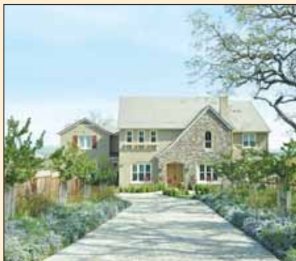
788 VINEYARD TERRACE, PLEASANTON Country Chateau Vineyard Estate on approximately 1 acre secluded lot (40,029 sq. ft.). Professionally landscaped with multiple heritage oaks, adjacent to vineyards. Panoramic views of Mount Diablo and the surrounding hills. This semi-custom beautiful private home built by Greenbriar Homes in 2008 has a total square footage of 6,476. The main house at 5,330 square feet includes five bedrooms plus library (6th), six bathrooms and a super bonus/home theater room. Also included are a four car garage and private carriage house at 1,146 square feet. OFFERED AT $1,995,000