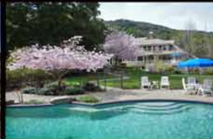
8044 Golden Eagle, Pleasanton $2,852,000 Golden Eagle Estates 5 Bd/ 4.5 Ba 5,828+/- sq.ft.