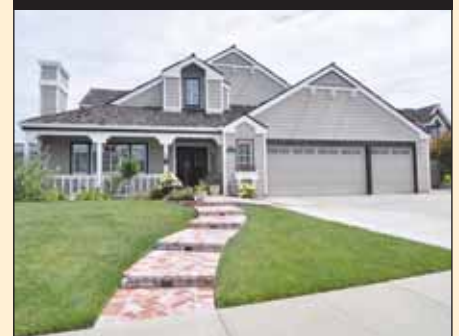
5071 MONACO DRIVE, PLEASANTON Beautiful upgraded Harrington Model in Pleasanton Hills. Panoramic views of Mount Diablo, the valley and Pleasanton Ridge. Four bedrooms (one downstairs), three bathrooms, upgraded kitchen, crown molding, plantation shutters, upgraded doors and casings, newer dual pane windows and three car garage. Expandable option for fifth bedroom. Approximately 3,000 square feet. Lot size is 8,158 square feet with upgraded landscaping. Located on quiet street. Just steps to great neighborhood parks and Main Street Downtown Pleasanton! OFFERED AT $1,029,000