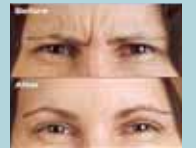
Unretouched clinical photo taken while frowning before and 14 days after treatment with Botox® Cosmetic