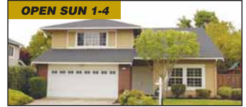
OPEN SUN 1-4 4520 Lin Gate Street, Pleasanton 4bd/3ba, 2,179+/-sq.ft Offered at $819,000