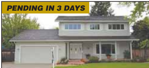
PENDING IN 3 DAYS 5087 Blackbird Way, Pleasanton 4bd/2.5ba, 2200+/- sq.ft Offered at $809,000