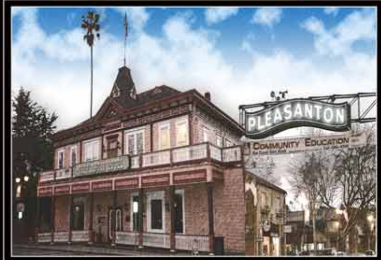
Downtown, Pleasanton Call for Price. Storybook Tudor home filled with charm and character.