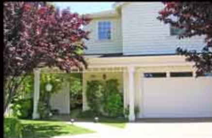
4264 First St., Pleasanton $1,100,000 Just Listed! Downtown Pleasanton Beauty