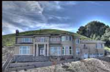
7870 Galway Ct., Dublin $1,538,000 Contemporary Living 5 Bd/ 5.5 Ba 5,000+/- sq.ft.