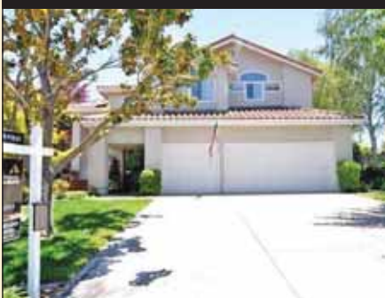
749 CRYSTAL LANE, PLEASANTON Don't miss this beautiful home in the desirable Diamond Collection. Five bedrooms, 5th is office/guest suite downstairs, three bathrooms, updated kitchen with new granite countertops, custom tumbled marble backsplash & stainless steel appliances. Expansive master suite with retreat & viewing balcony, new carpet throughout, three fireplaces & three car garage. Approximately 3,000 square feet. Private rear yard with in-ground pool/spa & lawn area. Lot size is 8,230. Located on quiet street. Walk to great neighborhood park and Main Street downtown Pleasanton! OFFERED AT $1,169,950