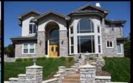
9663 Crosby Dr., Pleasanton $1,898,000 The "Preserve" 5 Bd/ 4 (2) Ba 5,200+/- sq.ft.

FOR MORE GREAT PROPERTIES CALL 925.251.2585 OR VISIT US ON THE WEB