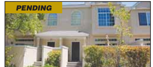
PENDING 654 Palomino Drive, Pleasanton 3bd/2.5ba, 2300+/-sq.ft Offered at $539,000