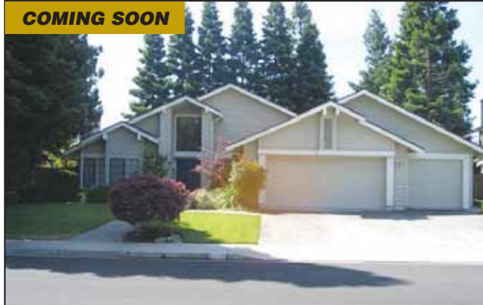
COMING SOON IN PLEASANTON Beautifully updated Solano model in Original Country Fair, 4bd/2ba, 2,274+/-sq.ft on a 10,000+/-sq.ft lot, new granite kitchen and baths, 3 car garage. Please call for private showing and details.