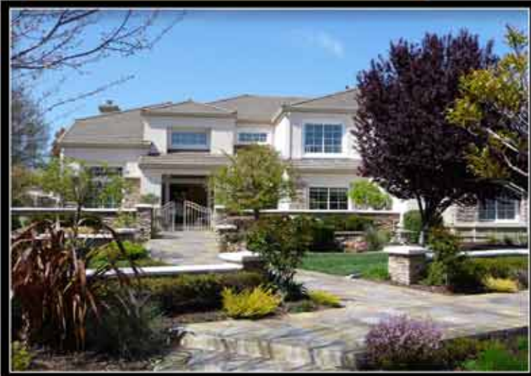
7914 Paragon, Pleasanton $1,588,000 Laguna Oaks 5 Bd/ 3.5 Ba 4,592+/- sq.ft.