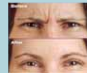
Unretouched clinical photo taken while frowning before and 14 days after treatment with Botox® Cosmetic