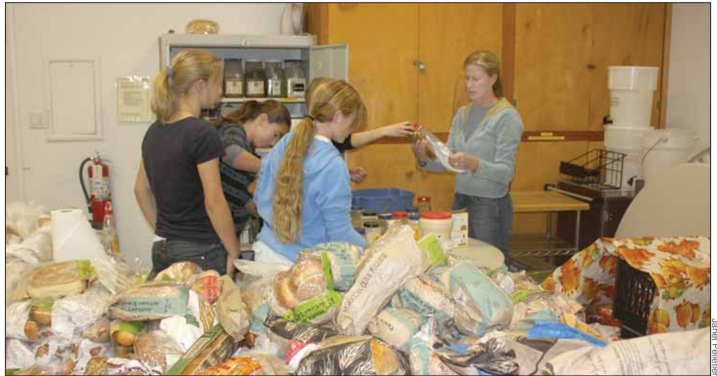
Volunteers help sort out loaves of bread at a recent hot meal service provided by Open Heart Kitchen at Asbury United Methodist Church in Livermore. With the economy in crisis, Open Heart has seen a 25 percent increase in demand and a 45 percent decrease in donations.

"Although Pleasanton is ranked as one of the wealthiest cities its size in the nation, there are thousands who rely on these seven organizations for individual and family assistance, emergency aid when they're suddenly without