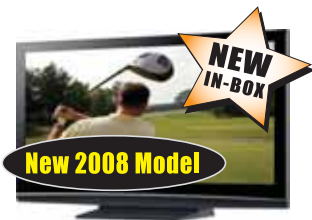
Panasonic VIERA™ 42" Plasma Hi-Def TV

Save up to 60% on all close-out, Demo & Overstock TVs, plus Audio & Home Furniture