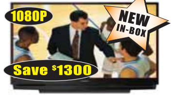
MITSUBISHI 1080P 73" DLP Hi-Def TV

With the TurboLight 180™ lamp system and Plush 1080P processing for unsurpassed detail with over 2 million pixels.