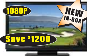
SHARP AQUOS™ 46" 1080P LCD Flat-Panel Hi-Def TV

With Sharp's exclusive Advanced Super View/Black TFT Panel with multi-pixel technology. Includes 3 HDMI inputs.