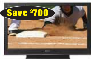
SONY BRAVIA™ 46" LCD Flat-Panel Hi-Def TV

The BRAVIA Engine™ full digital processor delivers great color and sharp details from any source.