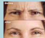
Unretouched clinical photo taken while frowning before and 14 days after treatment with Botox® Cosmetic