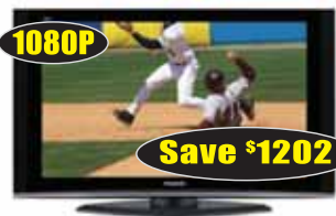
Panasonic VIERA™ 50" 1080P Plasma Hi-Def TV

Crystal-clear 1080P resolution. With video noise reduction, 5000:1 contrast ratio and built-in SD Memory Card slot.