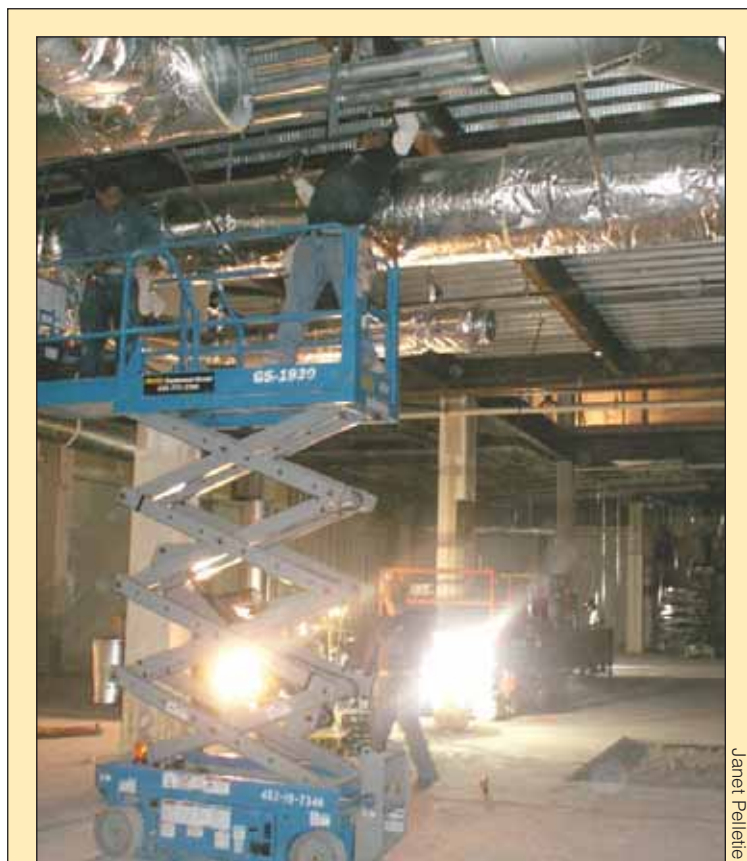
A crew performs some duct work at the site of the future H&M store, which will take up 16,000 square feet on two levels of the mall.