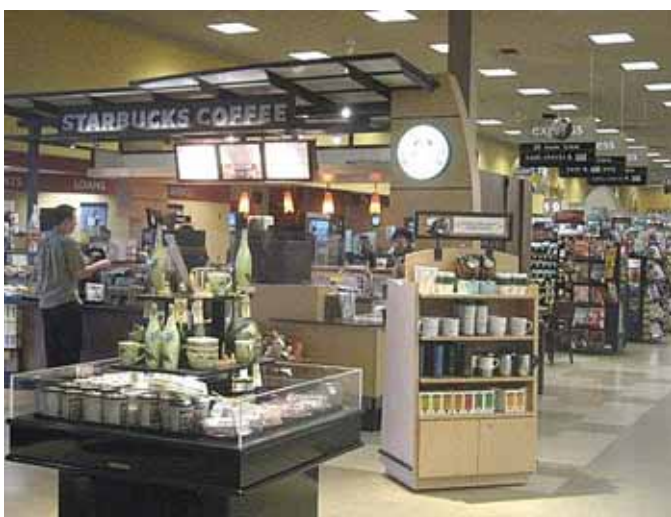
The Safeway store on Santa Rita Road at Valley Avenue was remodeled not too long ago and soon, Raley's on Sunol will be following suit to keep up the competition.