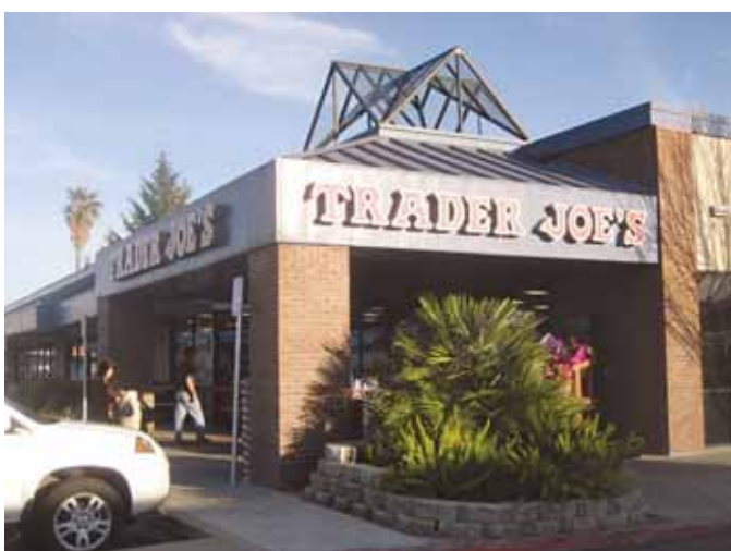
Trader Joe's stays competitive with larger grocery stores and even independent stores such as Gene's Fine Foods by offering a number of organic foods and products.