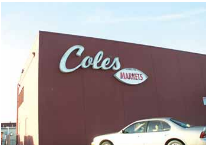
For a downsized, quick shopping trip, downtown residents enjoy Coles's Market, which is considered the oldest market in Pleasanton.