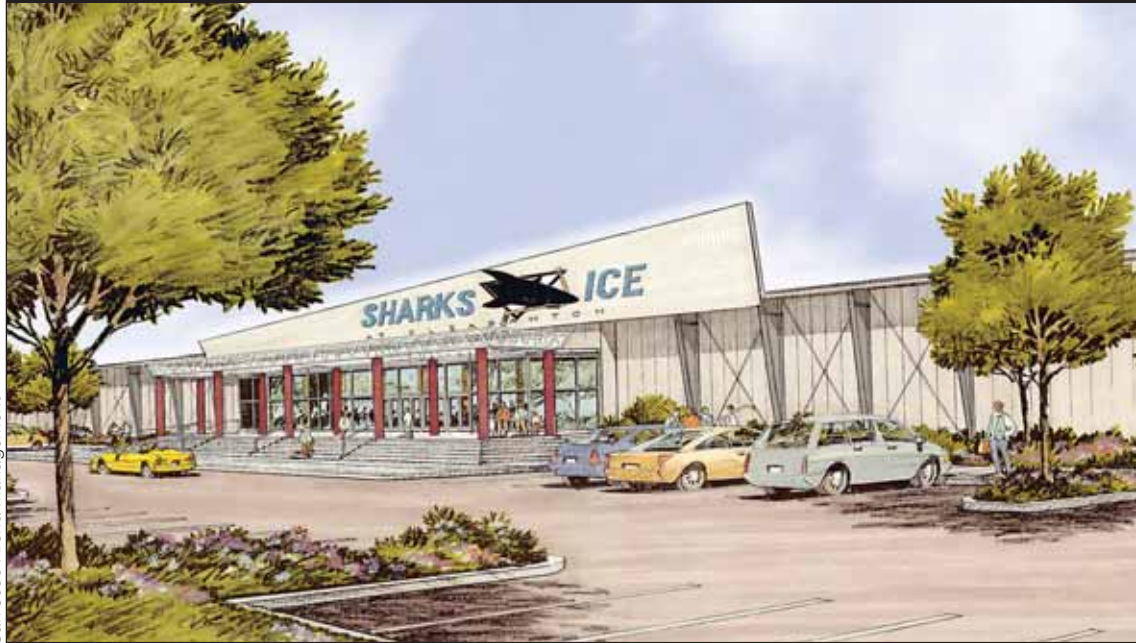
An artist's sketch of Sharks Ice arena proposed for a 10-acre site on Staples Ranch, just east of Pleasanton near I-580 and El Charro Road. The large two-rink facility, to be expanded to four rinks, would be one of 11 the Sharks have built to promote sports on ice.