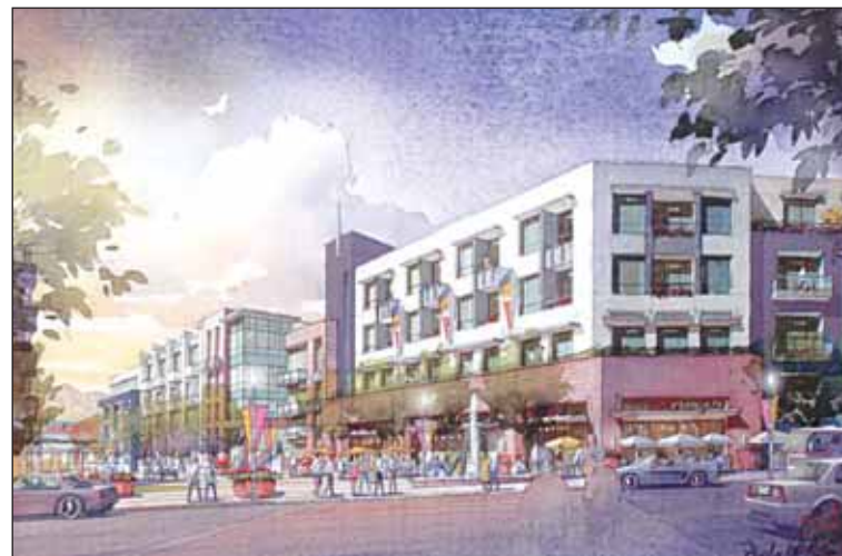
A preliminary artist's rendering by Windstar Communities depicts what some development in conjunction with the construction of a new West Dublin-Pleasanton BART station could look like on the Pleasanton side of Interstate 580 at Stoneridge Mall Road. Plans have yet to come before the city.