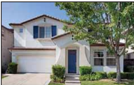
Mia & Bev Team

5124 Georgetown Cir. - Dublin $669,000 Spacious Dublin Ranch home on quiet street. Great open floorplan with a bright open kitchen that has an island and breakfast bar. This house has the optional flex room off the kitchen and can be used as hobby/play room or office. Private yard with fruit trees!