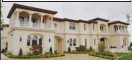
1976 Armondo Ct., Ruby Hill, Pleasanton

NEW LISTING – 9,820 sq. ft., 6 BR, 6 1/2 BA, billiard room, office. Spectacular views, pool, stunning. Offered at $3,795,000