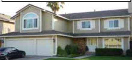
3216 Curtis Circle, Pleasanton

Desirable Parkside neighborhood remodel, 5 BR, Hickory gourmet kitchen, huge great room overlooking fabulous 9,000+ sq. ft. lot, w/ 3 car garage and side yard access! Offered at $1,075,000 OPEN SUN 1-4