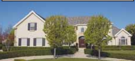
1121 Via di Salerno, Ruby Hill, Pleasanton

A traditional home of refinement and grace in 6,774 sq.ft., 6 BR, 6.5 BA, bonus room, & exec. office. Extensive use of wood moldings. Beautiful golf course views. Offered at $2,680,000 OPEN SUN 1-4