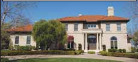
1137 Via di Salerno, Ruby Hill, Pleasanton

Exquisite Mediterranean home offering 5,411 sq.ft., 5 BR/or 4 BR + lg. bonus, exec. office. Premium finishes, spectacular bkyd. with pool/spa & breathtaking views of golf course and Mt. Diablo. Offered at $2,150,000