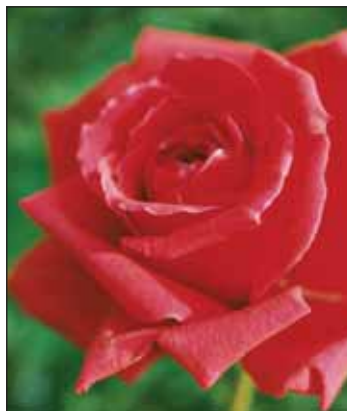
The Rose Show is a chance for anyone to bring their blooms to share and to be judged against others according to category.

Tags will be available Saturday morning for rose growers to label their entries with their name, address and phone number for each rose they are entering.