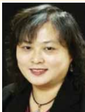
DRE # 01405184

LAND DEVELOPMENT • SHORT SALES • BANK OWNED PROPERTIES • RELOCATIONS • LUXURY ESTATES