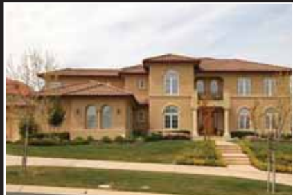
L.GOVEIA/P/GELLMAN BY APPT

PLEASANTON $2,100,000 5600+/-sf, 5bd/5ba, office, loft, gourmet kitchen, granite, stainless. Sparkling pool & spa on 1/4+/-acre lot. 4car garage with cabinets galore.