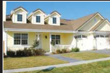
M.NOKES/D.BUENZ BY APPOINTMENT

PLEASANTON $1,179,000 Bygone Pleasanton era is captured in this charming NEW Victorian Farmhouse style home. 4bd/3ba 2700+/-sf single level home features covered porches, pool size lot.