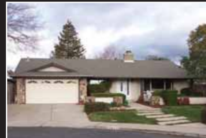
BRAD SLABAUGH BY APPOINTMENT

LIVERMORE $699,000 Rarely available court location in South Livermore. 5bd plus office 13,800+/-sf lot. Pool/side yard access and 2nd garage/workshop. Must see!