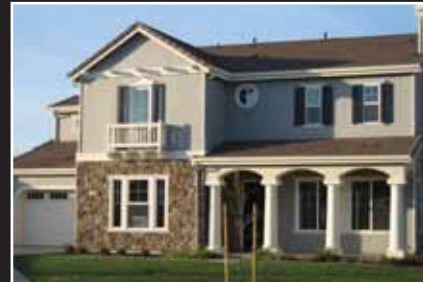
MOXLEY TEAM BY APPOINTMENT

PLEASANTON $1,450,000 Ironwood Estates 2 story, 5bd/4.5ba. Nestled within a court & close to the community pool. Spacious kitchen w/breakfast bar & opens to family room. 1 bd downstairs, bonus room upstairs. 4 car garage.