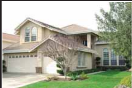
MARK JAMES BY APPOINTMENT

DANVILLE $749,000 PRICE REDUCED! 4bd/3ba/3car garage. Quiet Cul de sac location. Granite kitchen, professionally landscaped. Designer colors. Shows like a model.