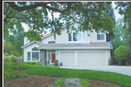
BLAISE LOFLAND BY APPOINTMENT

PLEASANTON $1,259,000 Gorgeous Gibson Model in Ventana Hills! Premium lot backs to open space. 5bd/3ba/3179+/-sf. Upgraded kitchen/granite/travertine/new carpet throughout. Pool/spa. Professionally landscaped