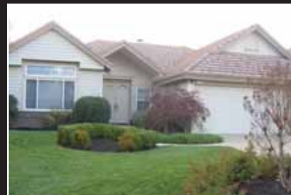
TIMOTHY MCGUIRE OPEN SAT 2-4

PLEASANTON $999,000 Stunning single story on corner lot in gated golf course community of Ruby Hills. 4bd/2.5ba, 2296+/-sf with professionally landscaped yard. Must See! 506 Trebbiano Place