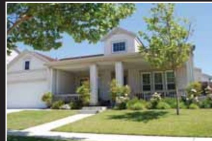
LINDA FUTRAL BY APPOINTMENT

LIVERMORE $849,950 Beautiful 5bd/2+ba open floor plan. Has custom pool with sheer descends, 8 person spa. Great backyard for entertaining! One of South Livermore's premier properties.