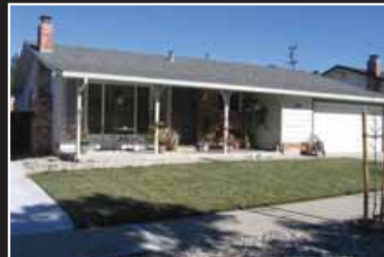
LANCE/KELLY KING BY APPOINTMENT

FREMONT $899,000 Beautiful 3bd/2ba Mission home. Remodeled kitchen and baths/ cherry wood flooring/newer carpeting/newer concrete landscaping and fencing/dual paned windows/newer water heater more!