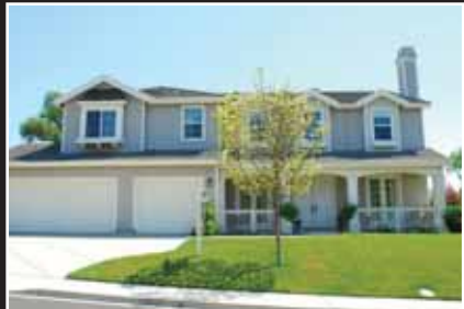
BLAISE LOFLAND BY APPOINTMENT

PLEASANTON $1,349,000 WOW! Spectacular Castlewood Heights home on premium lot w/Panoramic Views! 5bd+bonus game room & loft/4ba. Separate downstairs exercise room. Gourmet kitchen/granite/stainless.