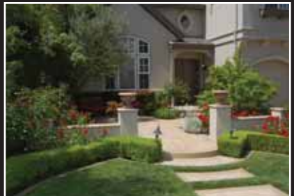
UWE MAERCZ BY APPOINTMENT

PLEASANTON $1,399,000 Gorgeous Ascona home in Ruby Hill! Immaculate and spacious 5bd/3ba On private cul-de-sac. Luxurious landscaping, close to clubhouse, backs up to open space with privacy galore!