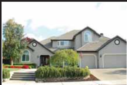
BLAISE LOFLAND BY APPOINTMENT

PLEASANTON $899,500 4bd+bonus/private office. 3680+/-sf. Upgraded kitchen with granite/stainless/crown molding/plantation shutters. Bamboo wood & custom tile floors.