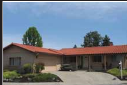
MOXLEY TEAM BY APPOINTMENT

PLEASANTON $710,000 4bd/3ba, Single Story built in 1967 with all its retro charm. Court location, side yard access, updated kitchen, formal dining, indoor laundry, private rear yard with mature trees.