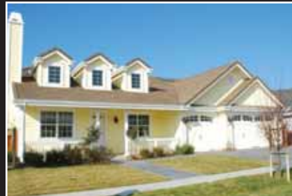
M.NOKES/D.BUENZ OPEN SAT/SUN 1-5

PLEASANTON $1,179,000 Bygone Pleasanton era is captured in this charming NEW Victorian Farmhouse style home. 4bd/3ba 2700+/-sf single level home features covered porches, pool size lot & $55k in custom upgrades. 1608 Cindy Way