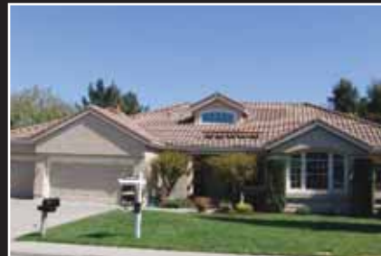
MARYJANE DEERING BY APPT

PLEASANTON $1,075,000 .48+/-acre lot with private backyard! 4bd/2.5ba, hardwood floors, slab granite, gas cooktop. Kitchen opens to family room. Master suite w/fireplace.