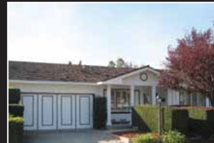
MOXLEY TEAM OPEN SUN 1:30-4:30

PLEASANTON $650,000 Near Pleasanton's award winning schools. Updated home with 4 spacious bd/updated baths, refinished floors, central air, private spacious yard. 1766 Orchard Way