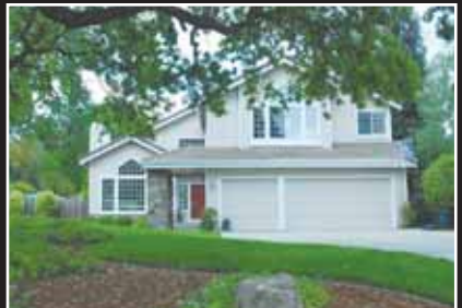
BLAISE LOFLAND OPEN SUN 1-4

PLEASANTON $1,259,000 Gorgeous Gibson Model in Ventana Hills! Premium lot backs to open space. 5bd/3ba/3179+/-sf. Upgraded kitchen/granite/travertine/new carpet throughout. Pool/spa. 1141 Lund Ranch Rd.