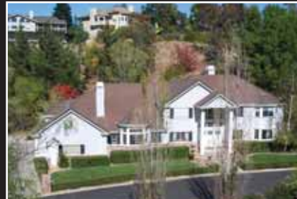
STASIA POIESZ BY APPOINTMENT

PLEASANTON $1,688,888 Gorgeous contemporary 5bd plus custom home. Over 4400+/-sf, 4 car garage, 1+/- acre lot. Maple kitchen, stainless steel appliances, updated baths. Showing by appointment only.