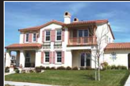
OTT/RICHARDS BY APPOINTMENT

LIVERMORE $1,150,000 6bd/4.5ba home had $100k in upgrades/over $130k in backyard landscaping. Tropical setting with Travertine patio/pool/waterfall+spa. Vineyard views.