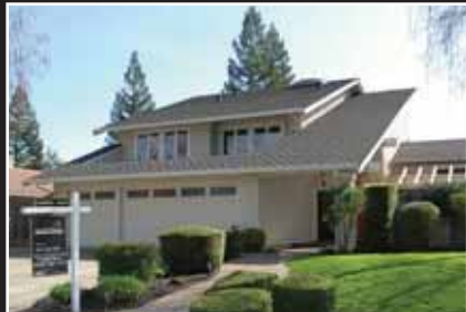
DOUG BUENZ OPEN SUN 1-4

PLEASANTON $1,199,000 Upgraded 5bd/3ba home in original Country Fair with huge 1/4+/- acre lot with pool, spa, hardwood floors and more. 2782 Calle Alegre