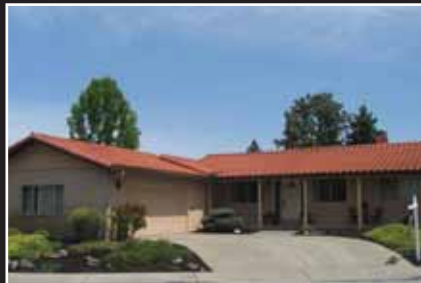
MOXLEY TEAM OPEN SUN 1:30-4:30

PLEASANTON $710,000 Single Story built in 1967 with all its retro charm! Court location, side yard access, updated kitchen, formal dining, indoor laundry, private backyard with mature trees and room for a garden. 6556 Stanton Ct.