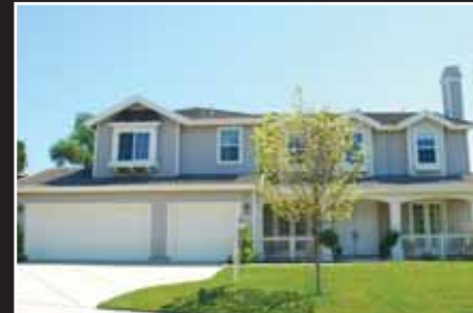
BLAISE LOFLAND BY APPOINTMENT

PLEASANTON $1,349,000 WOW! Spectacular Castlewood Heights home on premium lot w/panoramic views! 5bd+bonus game room & loft/4ba. Separate downstairs exercise room. Gourmet kitchen/granite/stainless. Beautifully landscaped.