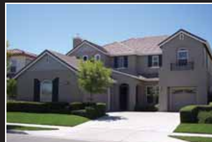
ANDY PORYES BY APPOINTMENT

PLEASANTON $1,099,888 New Price! Luxury 5 year old home. 3265+/-sf 5bd/4ba, pool,waterfalls, outdoor kitchen, high ceilings. www.w-lagoon.com