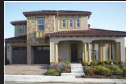
MARK KOTCH BY APPOINTMENT

DANVILLE $1,005,500 Beautiful 5bd/4.5ba, 3813+/-sf home Features granite counters/cherry cabinets in kitchen. Computer run home with solar panels. Corner lot 8472+/-sf.