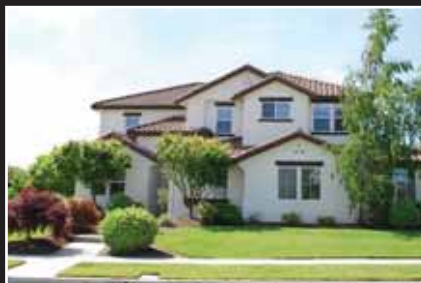
LINDA FUTRAL BY APPOINTMENT

LIVERMORE $1,099,000 Live in your own private resort with this magnificent South Livermore estate! Incredible pool/spa + more. Home boasts 5bd/4ba plus den.