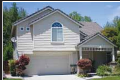
JOYCE & RICK JONES BY APPT

PLEASANTON $670,000 Upgrades Galore! 4bd/2.5ba, upstairs bonus room, updated kitchen/granite/Brazilian Cherry floors&cabinets. Plantation shutters, plush yard & pool.