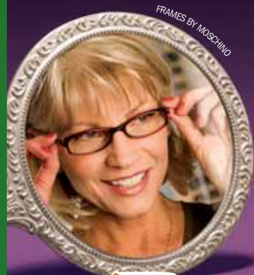
FRAMES BY MOSCHINO

Come in today and let us design a look for you with the latest designer eyewear and cutting-edge optical technology—at a price that won't have you seeing double!