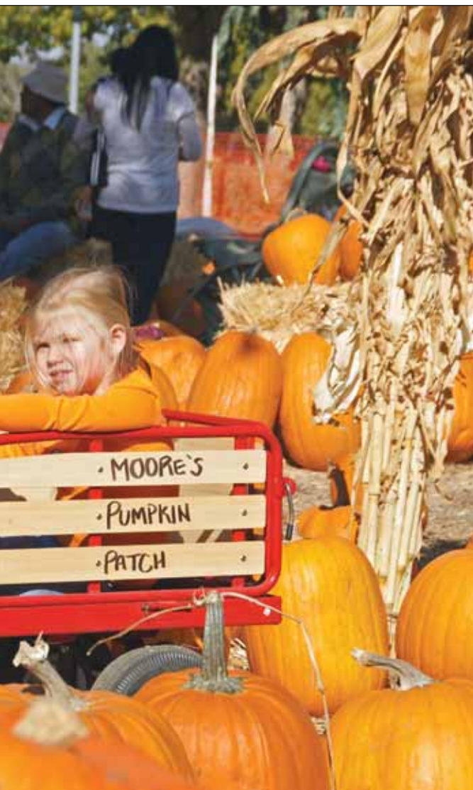
as parents shop for a pumpkin and other decorations at Moore's

celebrated on Oct. 31, its biggest celebrations are here in the U.S., marked by trick-or-treating, ghost tours, costume parties, haunted houses and carving pumpkins, which in Halloween-speak are Jack-o-lanterns. In many countries, the day is observed as the eve of All Saints Day and a time when church-goers dress in special costumes to ward off evil witches and the devil. It's also known as the Night of the Witches, which is hardly a festive holiday in the eyes of some Christian faiths.