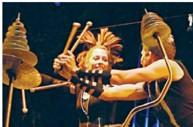
ScrapArts Music Group