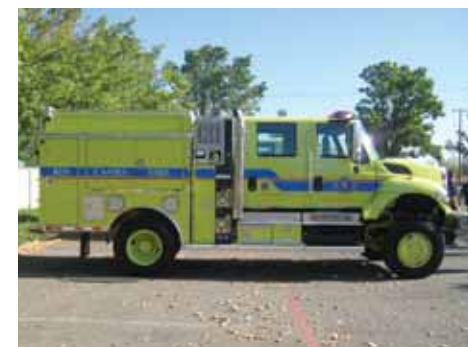
LPFD's new CA-OES Type III Wildland fire engine.

The new black and white patrol cars will soon be green as well, as part of a recent mandate to convert the entire city fleet to fuel efficient vehicles. The rising cost of fuel and a commitment to environmental stewardship are at the core of this new policy, which supports the purchase of hybrids and a conversion