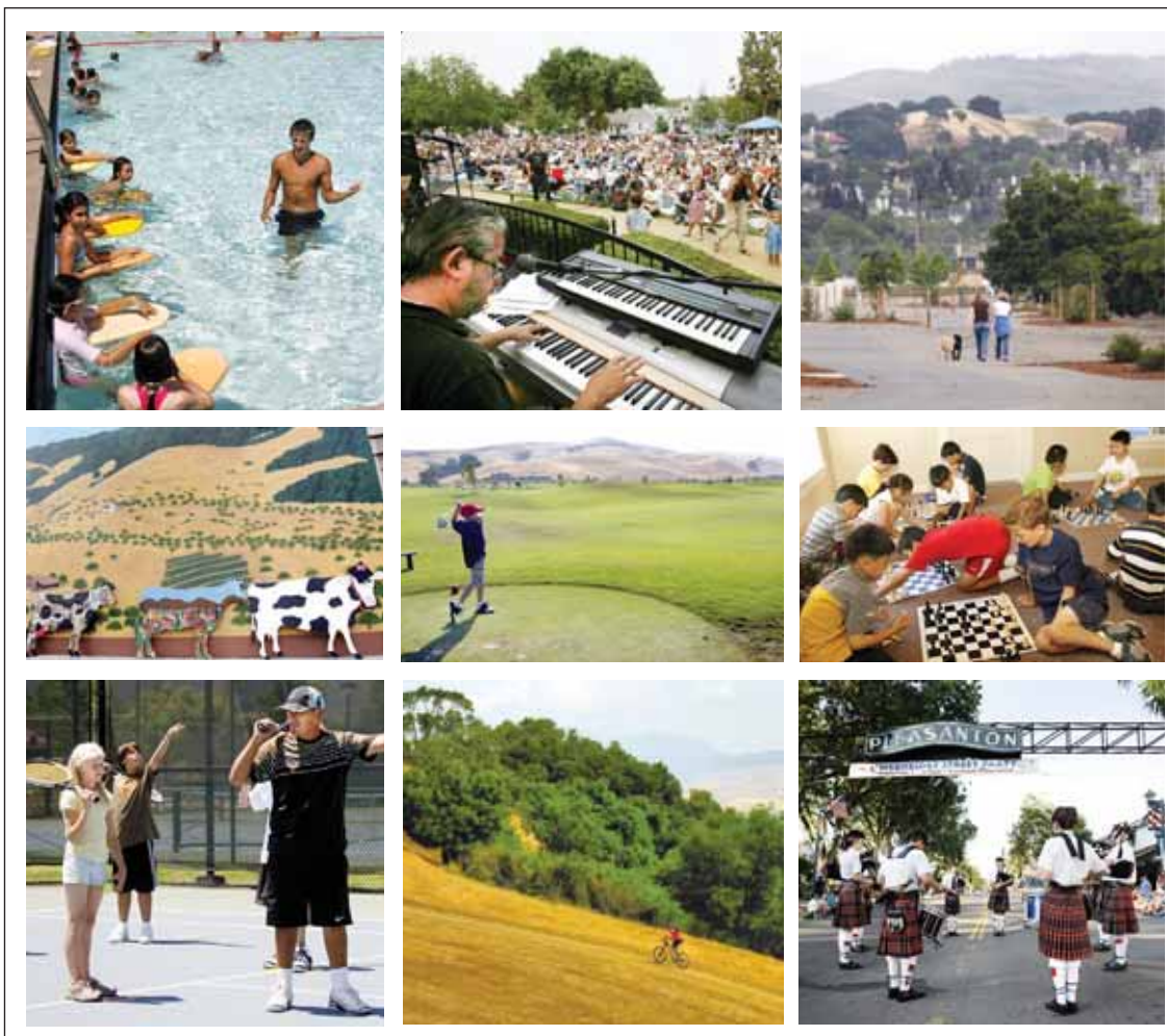
It's a wrap—another fabulous summer in Pleasanton!

Residents can bolster these efforts with their own individual Emergency Preparedness Plan. There are many ways to do this, but a great way to start is to contact the Emergency Preparedness Unit of the Livermore-Pleasanton Fire Department (LPFD) to schedule a presentation to your neighborhood, church group or local organization. Learn how your family can develop its own emergency plan and learn lifesaving emergency skills such as First Aid, CPR and automatic external defibrillator (AED). To schedule a presentation, please call LPFD at (925) 454-2361. You can also find emergency preparedness information at http://www.ci.pleasanton.ca.us/services/fire/emergency-preparedness.html .