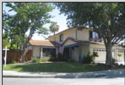
4804 Knox Gate Court, Pleasanton 4bd/2.5ba, 2125 sq. ft. court location Offered at $849,000