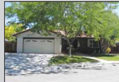
2822 Jones Gate Ct., Pleasanton 3bd/2ba single story Offered at $785,000