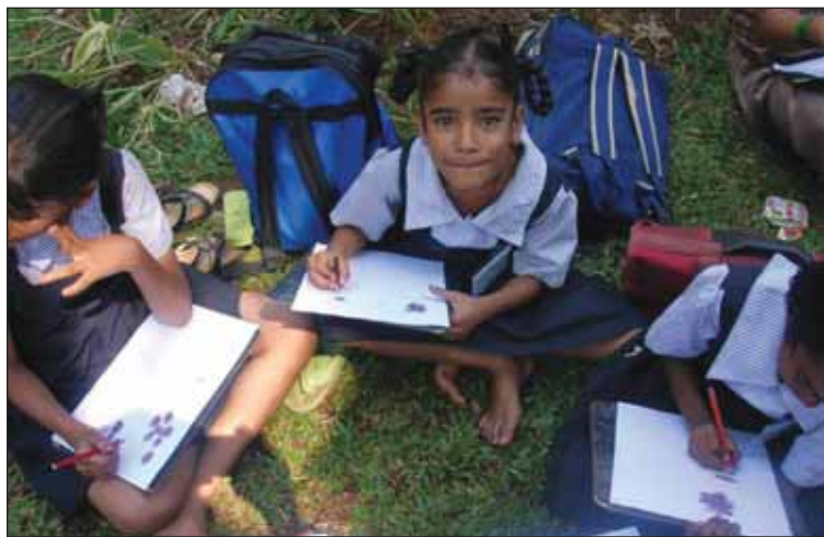
Children practice art during a workshop.