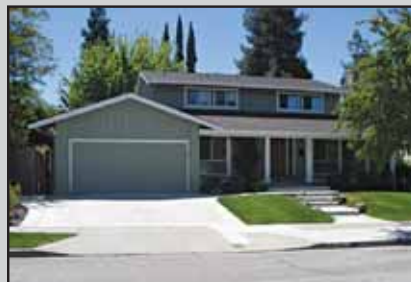
1021 Crellin Road, Pleasanton 4bd/3ba premium Offered at $799,000