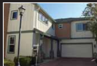
Pleasanton $729,950 1037 Hometown Way