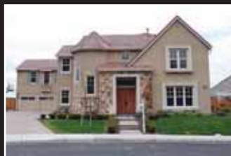
Pleasanton $2,099,950 1327 Montrose Place