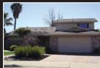
Livermore $829,000 2043 Lomitas Court