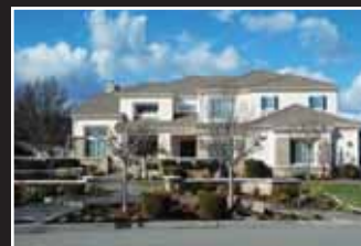
Pleasanton $1,849,000 7914 Paragon Circle