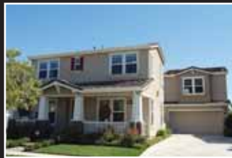
Pleasanton $1,429,000 1369 Royal Creek Court