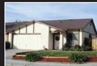
Livermore $414,950 4196 Pinon Way

There will be a drawing to win $75 Gift Certificates to Barones, Movida, Round House Grill and Simply Fondue.