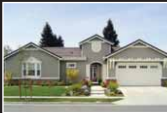
Pleasanton $1,530,000 1404 Briones Court