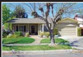
Pleasanton $839,000 2516 Raven Road