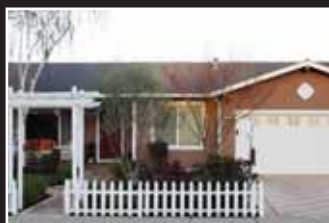
Pleasanton $869,000 1729 Greenwood Road