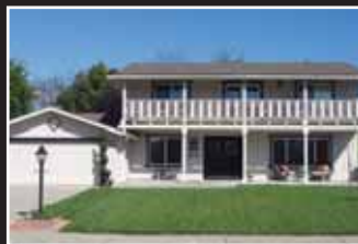
Pleasanton $1,099,000 1807 Tanglewood Way