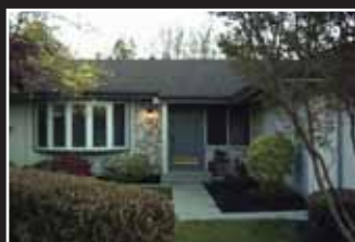
Pleasanton $785,000 677 Merlot Court