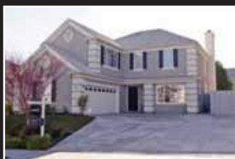
Livermore $799,000 4293 Bellmawr Drive