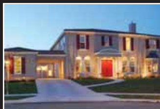
Pleasanton $1,890,000 7193 Rosecliff Court