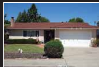
Livermore $479,000 722 Grace Street