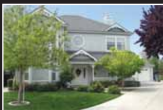
Livermore $889,950 1153 Riesling Circle