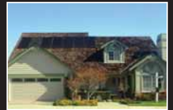
Pleasanton $1,250,000 4931 Monaco Drive