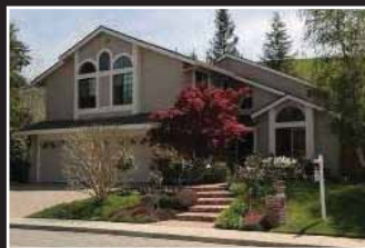
Pleasanton $1,099,950 3142 Arbor Place