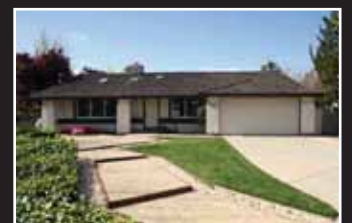
Livermore $689,950 1285 Norwood Place