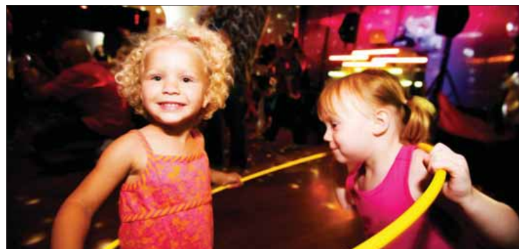
Babies play and dance at a recent Baby Loves Disco event.

Nightclub opens for the younger set next Saturday