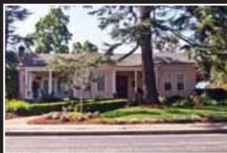
Livermore $1,170,000 1909 College Avenue