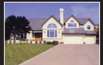
Pleasanton $1,649,000 2977 Amoroso Court