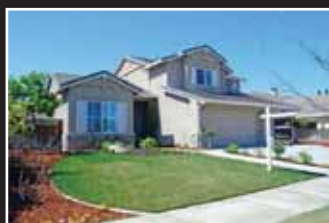
Livermore $789,950 1135 Rebecca Drive