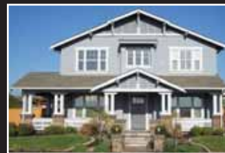
Livermore $1,050,000 2604 Kellogg Place