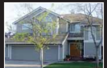
Livermore $799,000 592 Amberwood Way