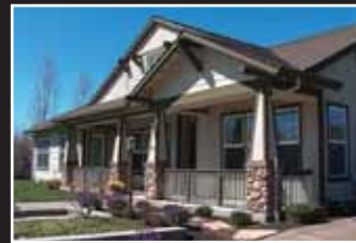
Livermore $1,349,000 932 Hansen Road