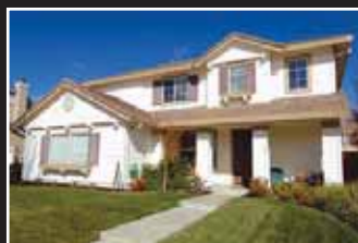
Livermore $659,950 5832 Lobelia Way