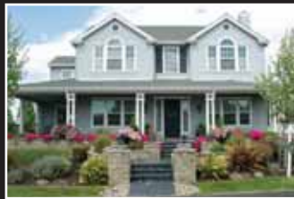
Livermore $1,499,000 2256 Sevillano Court