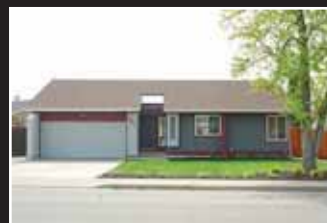
Livermore $538,750 281 Murdell Lane