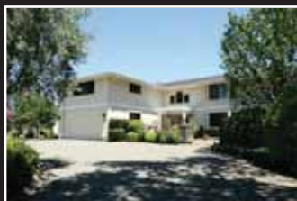
Pleasanton $2,250,000 6022 Alisal Street