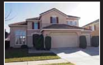
Livermore $915,000 1642 Feldspar Court