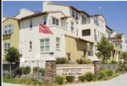
MOXLEY TEAM BY APPOINTMENT

Dublin $425,000 2bd/2ba, 1420+/-sf home. Attached garage, single level, upgraded flooring, hardwood floors, crown molding, tile baths. Master suite, patio, walk in closet, tile bath, separate tub, dual sink vanity.