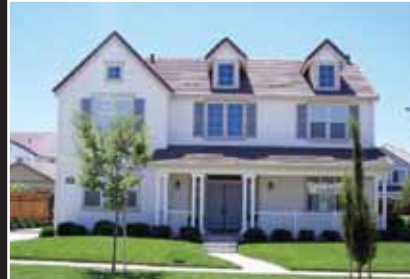
JOYCE JONES BY APPOINTMENT

Livermore $879,000 5 bd(possible 6th bd)/4ba. Kitchen features granite slab, Wolf cooktop, double ovens, large island with breakfast bar, soaking tub in master bath. Alarm system, automatic security gate, 3-car garage.