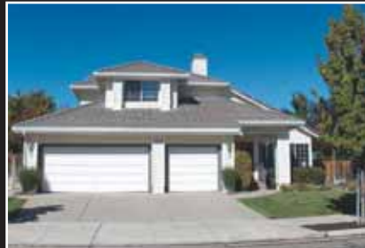
MARTA RIEDY BY APPOINTMENT

Livermore $790,000 Beautiful Amber Ridge well cared for 4bd/3ba, 2872+/-sf home. Hardwood floors, new carpet, fresh Decorator paint and Plantation shutters. Huge lot with play structure, BBQ area and large side yard.