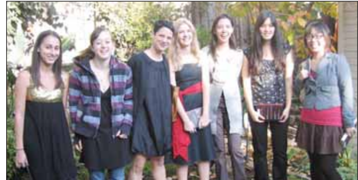
Cox was chosen as one of the girls to read her entry at a book signing party in New York City.