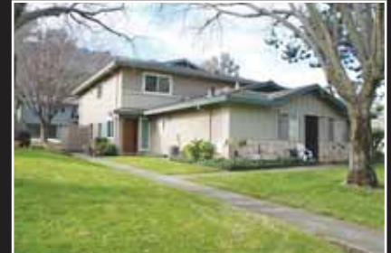
LINDA TRAUIG BY APPOINTMENT

Pleasanton $330,000 Cute as a button 2bd/1ba Townhouse nestled in the Foothills. Pleated shades throughout. Mirrored closet doors and built in shelves in Master. Great location in a quiet court. Close to pool/playground.