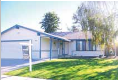
STASIA POIESZ BY APPOINTMENT

Pleasanton $640,000 Single story 4bd/2ba, 1700+/-sf home built in 1981. Formal LR and FR with wood burning fireplace. 6 year old roof, 1 year old furnace, water heater and A/C.