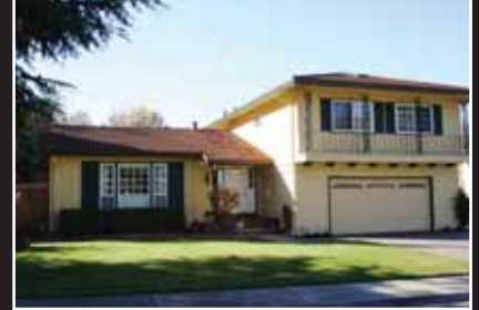
SALLY MARTIN BY APPOINTMENT

Pleasanton $990,000 Birdland charmer. 4bd/2.5ba, 2,253+/-sf tri-level home. Remodeled gourmet kitchen with slab granite and high end appliances. Updated baths. Open floor-plan.