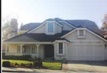
SUSIE STEELE BY APPOINTMENT

Pleasanton $1,275,000 Wonderful spacious 4bd (1 down)/ 3ba in Pleasanton Hills close to everything. Nicely updated. Nice sized backyard with pool/waterfall and spa. Close to neighborhood park.