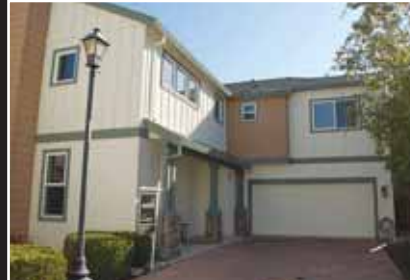
BRAD SLABAUGH OPEN SUNDAY 1-4

Pleasanton $749,900 No rear neighbors! Detached single family home built in 1998. Contemporary features include "Great Room" concept, generous light, volume ceilings. 3bd/2.5ba, 2029+/-sf. Close to downtown Pleasanton. 1037 Hometown Way