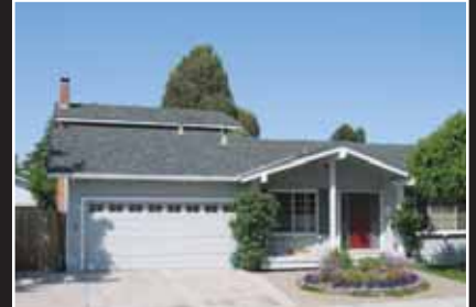
MOXLEY TEAM BY APPOINTMENT

Pleasanton $822,000 5bd/3ba, 2538+/-sf. 2 master suites. Baths recently remodeled. Hardwood flooring, recessed lighting. Kitchen with eat in area. Walk-in closet in master.