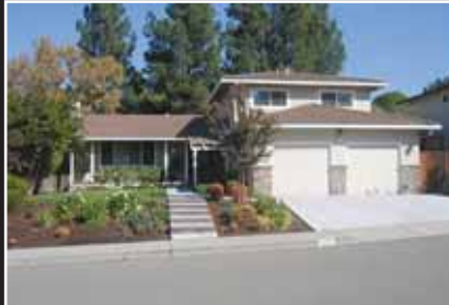
DEAN WAGERMAN BY APPOINTMENT

Pleasanton $944,950 Great 4bd/3ba, 2302+/-sf home almost completely redone! New kitchen has gas range, granite countertops and pantry. Bathrooms have been redone. Great yard with possible side yard access.