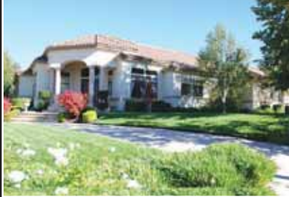
ANDY PORYES BY APPOINTMENT

Pleasanton $2,099,950 Beautiful Ruby Hill 4bd/4ba, 4578+/-sf home located on a flat .62+/-acre premium lot with no rear neighbors. Featuring office, master retreat, outdoor kitchen, large lawn, pool/spa. Circular driveway.