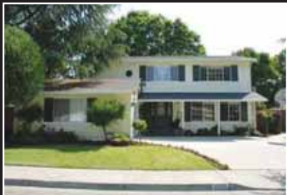
LINDA TRAUIG BY APPOINTMENT

Pleasanton $960,000 Stunning 5bd/2.5ba home in wonderful Del Prado neighborhood. Very open kitchen/family room with addition to dining area. Large master/vaulted ceilings. Beautiful backyard.