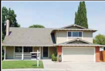
MARK JAMES OPEN SATURDAY 1-4

Pleasanton $773,000 Absolutely gorgeous 2040+/-sf home with 4bd/2ba, plus bonus room. Private cul-de-sac location. Recently upgraded. 7355 Jaybrook Ct