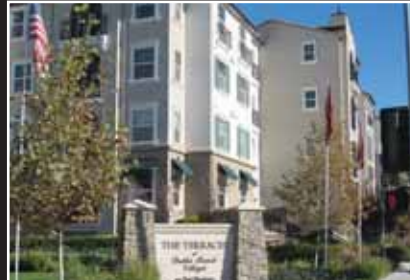
MOXLEY TEAM BY APPOINTMENT

Dublin $399,000 This 2bd/2ba, 1066+/-sf home offers hardwood floors, granite, large patio, and indoor laundry. Located on the first floor with a private corner location.