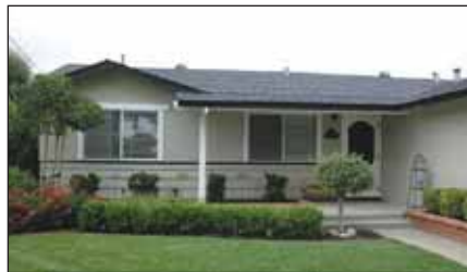
LIVERMORE 668 EL CAMINITO UPDATED CUTIE $565,000

4 BR 2.5 BA 2975 sq. ft., on a huge lot with a pool, in a gorgeous neighborhood with tree lined streets 925.847.2200