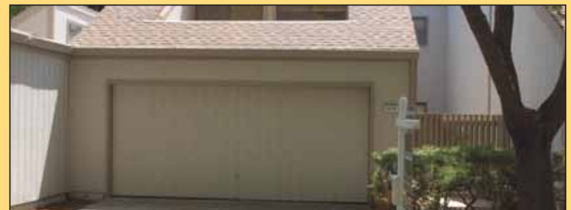
5119 Oakdale Ct, Pleasanton 3bd/2.5ba, 1650sf townhome with granite kitchen, laminate floors and new half bath. $559,000