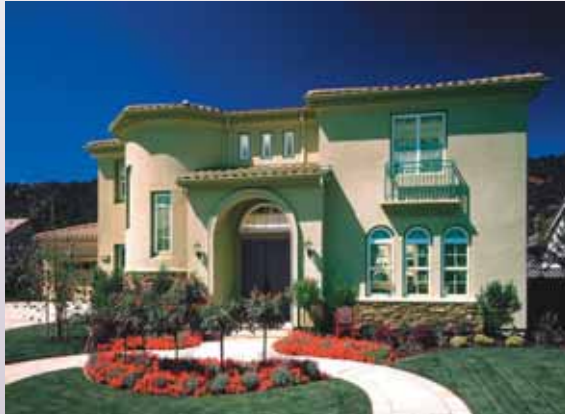
Pleasanton 1612 Laguna Hills Ln $2,199,950 5 BD, 4½ BA, Approx. 4,791 sq.ft., Brand New, Model home w/extensive upgrades on flooring, appliances, furniture/accessories and more! DAILY 10-5 pm CALL (925) 931-9898