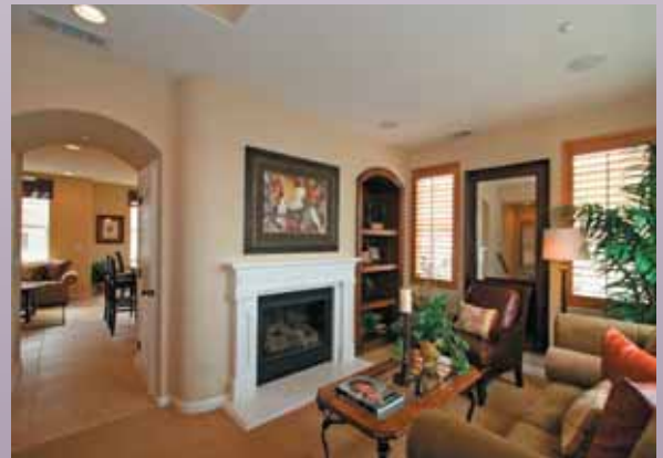
Dublin 5851 Hillbrook Place $778,950 3BD, 3½ BA, Approx. 1,692 sq.ft., Brand New Model Home, Upg tile floors, SS Appliances, Landscaping, 42" flat Screen TV, Furnishings, & more! DAILY 10-5 pm CALL (925) 829-7330