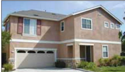
PLEASANTON SAT 1 - 4 5 JAY COURT WALK TO DOWNTOWN $799,950

1 BR 1 BA Freshly painted, formal dining room, beautiful refinished hrdwd flrng & lrg covered patio 925.847.2200