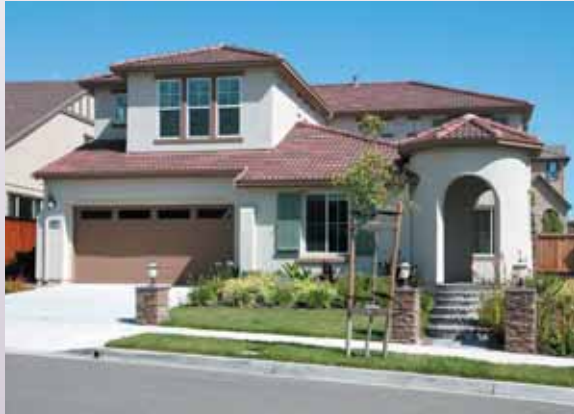
San Ramon 3288 Glencoe Circle $1,149,950 4 BD, 3BA, Approx. 3,568 sq.ft., 2 Yrs New, Immaculate, Granite Slab Kitchen, SS Appliances, Loaded with about 150K worth of upgrades! SUN 1-5 pm CALL (925) 600-8288

We've got homes to suit your lifestyle...