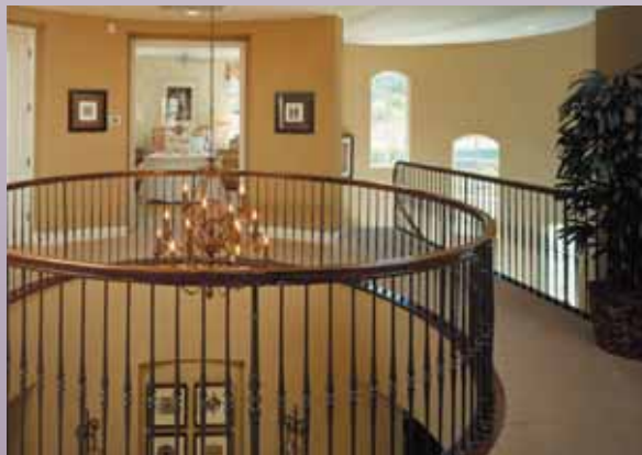
Pleasanton 2267 Vineyard Heights Ln $1,974,955 6BD, 5½ BA, Approx. 4,984 sq.ft. w/Separate Apt. Unit over Garage, cherry cabinets, Wolf/Subzero Appliances, hardwood floors, entry medallion, etc. DAILY 10-5 pm CALL (925) 600-8288