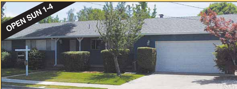
4114 Graham St, Pleasanton 3bd/2ba on large lot with new granite baths, roof, HVAC, carpet, paint and close to schools and downtown. $699,000