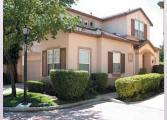
Pleasanton 5120 Merano Court $739,950 3 BD, 2½ BA, Approx. 1,719 sq.ft., Charming home w/Granite Slab Kitchen, SS Appliances, Two-tone paint, Wood flooring, and more! SUN 1-5 pm CALL (925) 600-8288