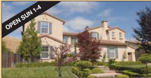
4055 Stone Valley Oaks Dr., Alamo 5 BR + office, 5 1/2 BTH. Newer luxury home on prime private 1/2 acre lot with upgrades galore! $2,499,900