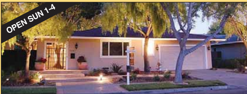
2347 Raven Rd, Pleasanton Birdland Beauty, Arbor Model. 4bd/2ba, 1900+/-sq ft. Complete remodel! Over $450,000 invested in quality upgrades inside and out—Simply Stunning. $989,000