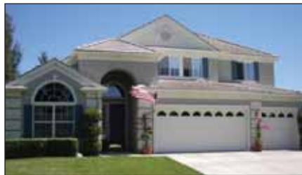
LIVERMORE 647 ELIOT DRIVE RARELY AVAILABLE $899,000

3 BR 2.5 BA Great value for this charming home, decorated to perfection, court location, 5 years young! 925.847.2200