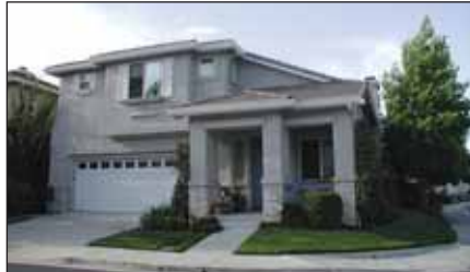
PLEASANTON SAT & SUN 1 - 4 3843 APPIAN ST VALENCIA NEIGHBORHOOD $772,500

4 BR 2.5 BA Only 8 yrs old! Huge kit. Ceramic tile flrng. New crpet/paint. Beautiful bkyd. w/cvrd patio 925.847.2200