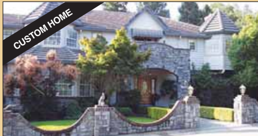
Elegant 5 BR + Bonus room, 4 1/2 BTH custom on large private lot in incredible wooded setting. $1,799,000