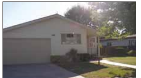
LIVERMORE SAT & SUN 1-4 229 COLEEN ST LISTING COMING SOON $539,888

4 BR 2 BA kitchen has granite counters, gas stove, dining rm or family rm w/ fireplace + living room 925.847.2200