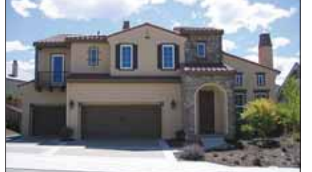
SAN RAMON 106 RODRIGUEZ CT GORGEOUS HOME $1,125,900

2 BR 2.5 BA kitchen has breakfast bar, dining area, living room w/fireplace, sunny patio, 1 car garage 925.847.2200