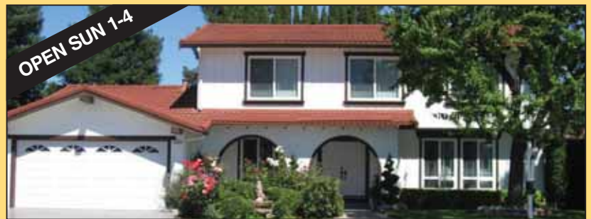
2009 Foxswallow Rd, Pleasanton 5+bd/3ba 2560+/-sf meticulously maintained home offers many upgrades. Walking distance to all three grade level schools. $1,049,000