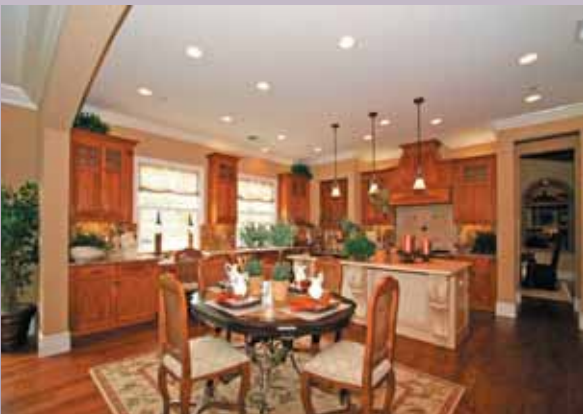
Los Gatos 293 Mountain Laurel Ln $3,799,950 6BD, 5½ BA, Approx. 4,600 sq.ft., on over 4 acres, Wolf/Subzero Appliances, Custom Cabinets, Vantage Lighting Control, wood floors, and more! DAILY (except Tues) 10-5pm CALL (408) 323-8600