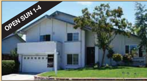
7722 Forsythia Ct. Upgraded 4 BR, 3 BTH home, over 2500 sq ft, with granite kitchen, vaulted ceilings. Private cul-de-sac lot! $899,500