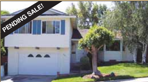
Spacious 5 BR + office, 3 BTH home on large .21 acre private lot with room to spare! $869,900