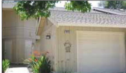
PLEASANTON 4213 SHELDON CIR 2 BDRM SUITE TWNHSE $470,000

3 BR 2.5 BA dramatic ceilings, tile flrs, neutral carpet, kit w/oak cabs, frplc, flgstone patio w/fountain 925.847.2200