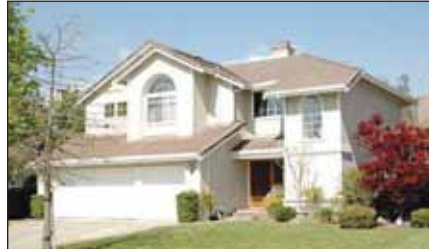
LIVERMORE SUN 1 - 4 4116 CAMROSE AVE AMBER RIDGE BEAUTY! $829,900 4 BR 3 BA 1 bed, 1 full bath on main floor in exquisite taste & a 3 car garage, yard with pool & spa 925.847.2200