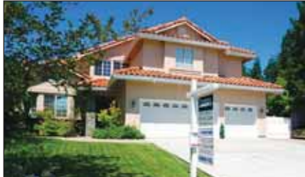
LIVERMORE SUN 1 - 4 482 KNOTTINGHAM CIR YOUR DREAM HOME $989,990 5 BR 3 BA + bonus rm, apx. 3412 sqft, kit w/slab granite, gorg yrd w/pl/spa w/wtrfls/lush landscaping 925.847.2200