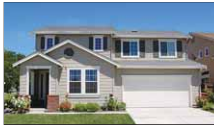
BRENTWOOD BEST VALUE $489,900 4 BR 3.5 BA + den, 2 car gar, designer tiles/paint, crown molding, fully landscaped, visit www.MLStrivalley.com 925.847.2200