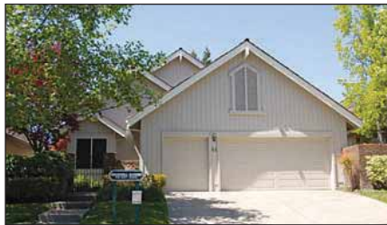
BLACKHAWK SUN 1 - 4 44 TENNIS CLUB DR. TOTALLY REMODELED! $1,349,000 4 BR 2 BA over 3,000 sqft, semi-custom hme. Remodeled top to bottom! Premium lot w/ breathtaking views 925.847.2200