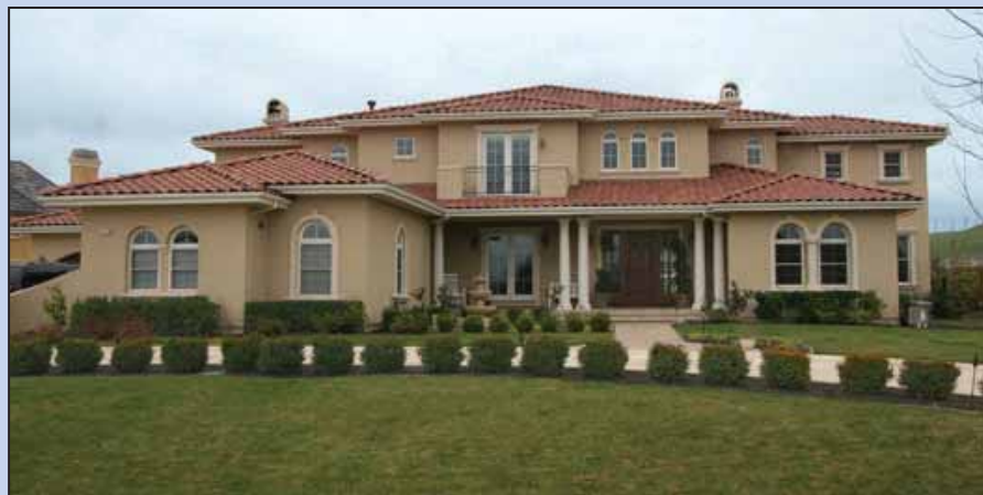
1773 Via Di Salerno - Just listed and totally remodeled 4 year old home. Better than new. 6600 sq ft, 5 bedrooms, 5 baths, 4 car garage gotta see it to believe it! $2,925,000