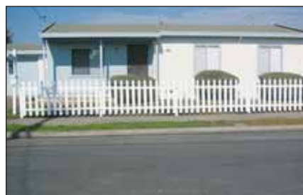
SAT 1 - 4 1109 INGLEWOOD ST, HAYWARD CHARMING & COZY $499,000 3 BR 1 BA cottage,lrg open kit w/eating area. Lrg yards w/storage shed & fruit trees, newly painted 925.847.2200