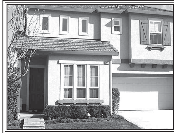
2627 CHOCOLATE STREET, PLEASANTON

This beautiful home is on one of the best lots at "Stoneridge Place". This "Bright and Airy" floorplan offers 2051sq.ft. living space featuring large living room with vaulted ceiling, formal dining, comfortable family room, 4 upstairs bedrooms, 2.5 baths. Spacious kitchen features a large breakfast nook, corian counter tops and abundant cabinetry. Lovely master suite features walk-in closet, dual sink vanity, tub and separate shower stall. Armstrong Laminate floors downstairs. Hunter Douglas blinds. Community pool and Spa. Walking distance to Mohr School. OFFERED AT $839,000.