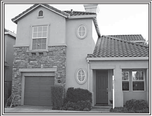
3148 SNOWDROP CIRCLE, PLEASANTON

This beautiful home is located on a private street of "Stoneridge Place", a desirable Pleasanton neighborhood. This bright house offers 1,536 square feet of living area featuring living room and formal dining with vaulted ceilings, 3 large upstairs bedrooms, 2.5 baths. Lovely master suite features large walk-in closet and dual sink vanity. Spacious kitchen features large eating area, abundance of cabinetry and white appliances. 2 car attached tandem garage. Professionally landscaped backyard with covered patio and a beautiful palm tree. Close to parks, community pool/spa and Mohr Elementary School. OFFERED AT $710,000