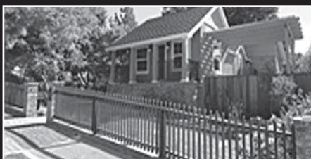
Open Sun 1-4 • 4304 2nd St., Pleasanton

Enjoy Downtown Living in this 9 year Old St. John Place Home. 4bd, 2.5ba, 2150sf. Backs to creek with views and privacy! Great location - walk to downtown! $1,060,000