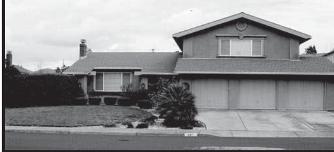
197 FRANSICAN DRIVE, DANVILLE

4 Bedrooms/ 3 Baths, 2,500 sq. ft. Large Lot, Light & Bright 1 Bedroom & 1 Bath Downstairs Great Location