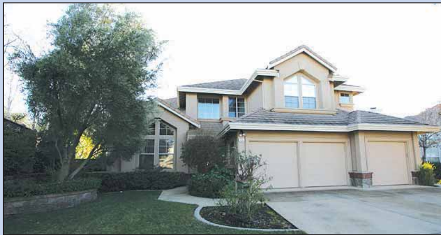
439 Montori Ct - Very affordable Ruby Hill home featuring park-size rear yard, 5 bedrooms, 3 car garage on great cul de sac. Reduced to 1,325,000