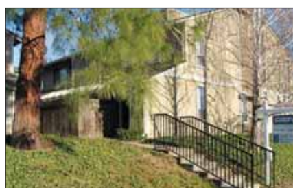
SUN 1 - 4 108 MISSION DR., PLEASANTON PRICE REDUCED $435,000 2 BR 1.5 BA Perfectly situated townhome w/new paint/blinds/flooring & updated baths w/gorg lighting 925.847.2200