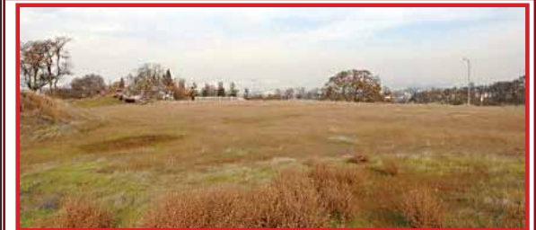
4209 GRANT COURT, PLEASANTON

Price upon request This beautiful 2.8 acre property is located in the highly desirable location of Kottinger Ranch. This land has the potential that your imagination offers, plus the benefits of neighborhood amenities like tennis courts and community pool. Convenient proximity to downtown Pleasanton! Last lot available!