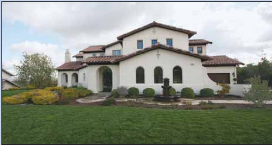
4244 Brindisi Place - Ruby Hill - Just listed. Most affordable (by sq. ft.) in all of Ruby Hill. 5300sq. ft., huge office and gigantic bonus room situated on quiet cul de sac with enormous yard and views of vineyards.