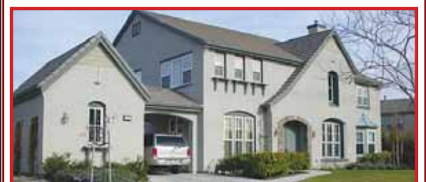
7251 BEAUMONT CIRCLE PLEASANTON

A Beautiful Estate Home and a Prime Court Location in this Neighborhood with Views of the Pleasanton Ridge. Elegant Living with a Desirable Open Floorplan Including 5,096 approximate sq. ft., 6 Spacious Bedrooms, 6 Baths Plus a Large Bonus Room. Generous 16,000+ sq. ft. Lot with Gorgeous Pebble-Tec Pool.