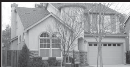
Open Sun 1-4 • 748 St. John Circle, Pleasanton

One of a kind Foothill Rd. property sits on 6 serene acres! Panoramic views of the Valley from this gated and private Sunol location. 2500 sq. ft. home with hardwood floors, new composition roof, new air and heat. Master suite + retreat, with French doors to new deck. 4 car garage and workshop. Possible to build 2nd unit up to approximately 1200 sq. ft. (In-law/Caretaker's Cottage). Zoned for Horses! $1,589,000