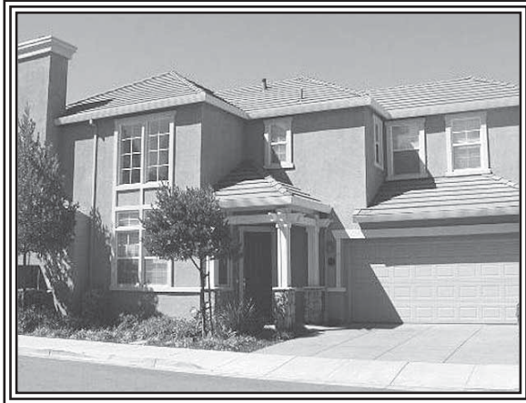
3106 SNOWDROP CIRCLE, PLEASANTON

This beautiful home is located on a private street of "Stoneridge Place", a desirable Pleasanton neighborhood. This bright house offers 1,536 square feet of living area featuring living room and formal dining with vaulted ceilings, 3 large upstairs bedrooms, 2.5 baths. Lovely master suite features large walk-in closet and dual sink vanity. Spacious kitchen features large eating area, abundance of cabinetry and white appliances. 2 car attached tandem garage. Professionally landscaped backyard with covered patio and a beautiful palm tree. Close to parks, community pool/spa and Mohr Elementary School. OFFERED AT $710,000