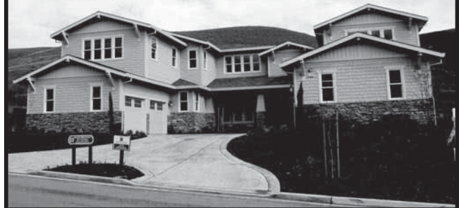
5250 CLUBHOUSE DRIVE, PLEASANTON

On the New Callippe Golf Course. 4 Bedroom plus Office. 5,000 sq. ft. Over 1/2 an acre. 4 car garage, 4 1/2 Baths. Don't Miss it.