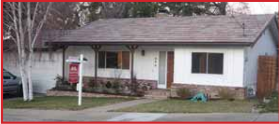
3205 DERBY CT, LIVERMORE Offered at $1,525,000

This spectacular Ponderosa Legacy home is located in the heart of the vineyards. 16,034 sq. ft. lot. Features include 5 BD/5 BA. Kitchen has granite counters, stainless Viking appliances & beautiful tile floors. Pebble Tec pool & built-in BBQ. Virtual tour at www.circlepix.com/home/AJ9VH3 .