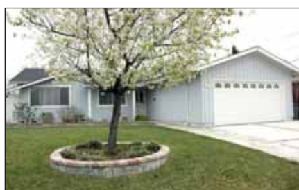
SUN 1 - 4 721 DEL MAR AVE, LIVERMORE BEAUTIFUL HOME $589,000 3 BR 2 BA w/lrg family rm/kit for easy entertaining.Bthrms & kit are updated w/hrdwd flrs,new carpet 925.847.2200