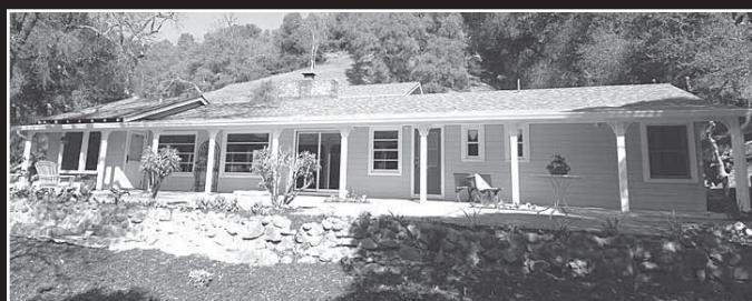
Open Sat & Sun 1-4 • 12587 Foothill Rd, Sunol

RESIDENTIAL SALES • INCOME PROPERTIES 1031 EXCHANGES • LAND AND DEVELOPMENT