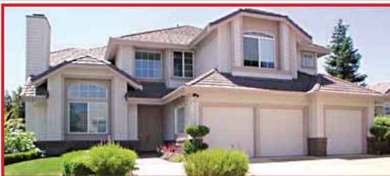
567 MONTORI COURT, PLEASANTON

Offered at $1,299,000 Charming home in Premia of Ruby Hill. For more home details visit www.rubyhill.net or call 925-426-7957