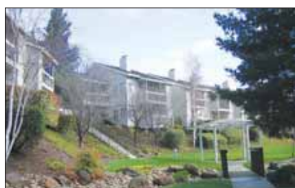
8040 MOUNTAIN VIEW DR, UNIT G, PLEASANTON SIMPLY STUNNING $449,900 2 BR 2 BA 1,050 sq. ft.,hardwood flrs,designer paint,indoor laundry,fireplace,detached garage + more 925.847.2200