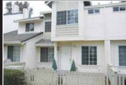
BARRACLOUGH & DAVIS BY APPOINTMENT

DUBLIN $535,000 Charming Condo in a fabulous Dublin Location. Serene setting close to a beautiful park and Dublin hills. 3 bd, 2 1/5 ba. 1383+/-sf of living space with an attached two car garage. Nice open floor plan. Comm. pool and Spa.