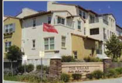
KRIS MOXLEY SUN 1:30-4:30

DUBLIN $639,000 Villas at Dublin Ranch. 3bd/2ba, 1548+/-sf. Single level luxury condo. Granite kitchen, hardwood flooring, raised paneling, custom paint, recessed lighting, walk in closet, attached garage. 4210 Clarinbridge Cir