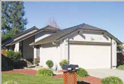
MAUREEN NOKES BY APPOINTMENT

PLEASANTON $595,000 Lowest priced home in Pleasanton! Lovely single level 2bd/2ba. Private yard with spa/covered deck, frpl, vaulted ceilings, 2 car garage. No HOA dues.