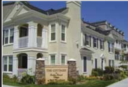
KRIS MOXLEY SUN 1:30-4:30

DUBLIN $579,000 Cottages at Dublin Ranch. 2bd/2ba, 1320+/-sf. Single level, no stairs, attached garage. Luxury condo with granite kitchen, dining room, gas cooking, patio, indoor laundry room. 3707 Whitworth