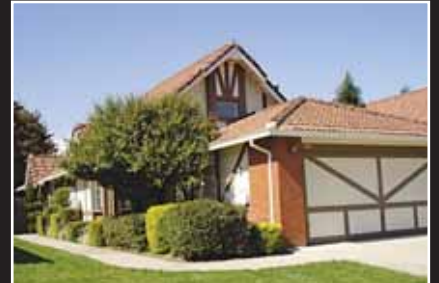
UWE MAERCZ BY APPOINTMENT

LIVERMORE $638,888 Nice 4bd/2ba, 1616+/-sf home. New paint, carpet, granite slab counter tops. Rock surround fireplace in family room. Skylit kitchen/nook and garden window.