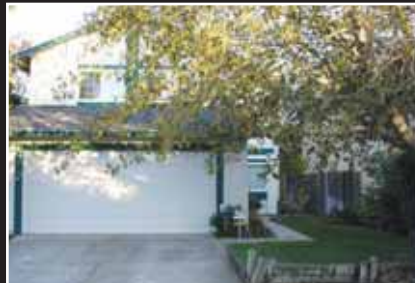
SALLY MARTIN BY APPOINTMENT

PLEASANTON $669,000 Charming home in great location. 3 bd/2.5 ba, 1468+/-sf. Fabulous loft not included in sf. Gourmet kitchen with granite counters and island. Shows light and bright. Updated bath with jetted tub.