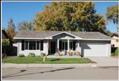
TIM MCGUIRE OPEN SUNDAY 1-4

PLEASANTON $809,000 Charming 4bd/2bd single story home near Aquatic Center pool/Park and close to all three grade level schools. Recently painted inside and out with updated baths, new windows, A/C/furnace. 1613 Orchard Way