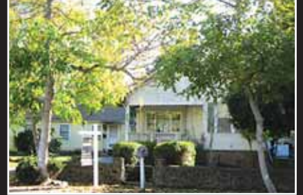
KRIS MOXLEY BY APPOINTMENT

PLEASANTON $1,200,000 2 lots with ability to merge total .30+/- acres. 2 homes, one: 2 bedroom/1 bath main house built in 1908 with a full basement. Other home built in 1920. Property backs to Creek.