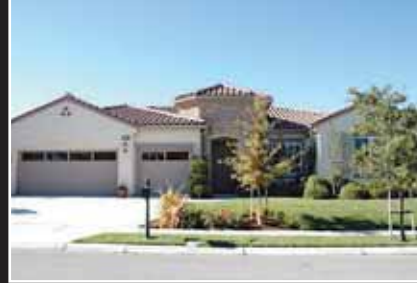
LINDA TRAUIG BY APPOINTMENT

PLEASANTON $1,649,000 This beautiful Bridle Creek Single Story Home has it all! Located in a great neighborhood with 5 bedrooms, 4 full bathrooms, and too many features and upgrades to note!