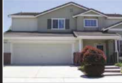
ROSEMARY DUTRA BY APPOINTMENT

DUBLIN $799,000 Beautiful bright 4bd/2.5ba Creekside home! Huge master with 2 walk-in closets, hardwood floors in entry, LR and DR with tile in the kitchen. Built-in TV center and interior freshly painted.