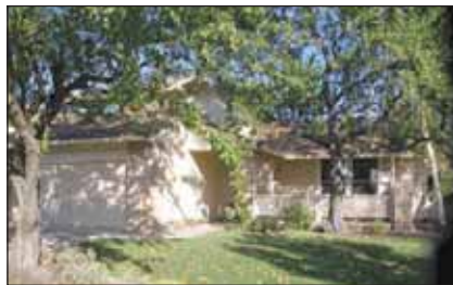
3537 GULFSTREAM ST, PLEASANTON BEAUTIFUL CURB APPEAL $770,000 4 BR 3 BA Bedroom down stairs, step down to family room w/ fireplace. Private rear yard and tile roof 925.847.2200