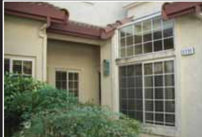
ESTHER BECKER OPEN SUNDAY 1-4

PLEASANTON $645,000 3 bedroom, 2 1/2 bath, 1611+/-sf. Two single car garages. Located in desirable Verona. HOA includes: Club House, Pool, spa, playground and greenbelt. 3339 Rosada Court