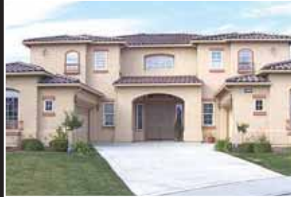
KIM OTT OPEN SUNDAY 1-4

DUBLIN $2,125,000 Spectacular 5bd/5.5 ba, 5,300+/-sf home on 12,600+/-sf lot offering magnificent views of Mt. Diablo and the Valley. Includes 2 offices, a gourmet kitchen, built-in fireplace on patio. 6162 Bay Hill Ct