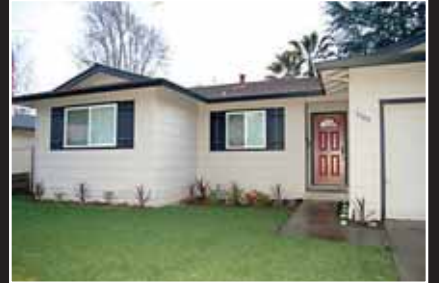
KRIS MOXLEY BY APPOINTMENT

PLEASANTON $699,000 Charming single story with 3bd/2ba. Updated throughout with tile counters in kitchen, Brazilian Cherry floors, dual pane windows, new interior doors with rubbed bronze fixtures, generous closet.