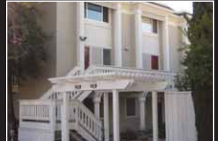
BARRACLOUGH & DAVIS OPEN SUN 1-4

PLEASANTON $369,000 2 bedroom, 2 bath condo near downtown Pleasanton. Approximately 1029 square feet of living space. This roomy condo has newer carpet and doors, ceiling fans and recessed lighting. 3399 Norton Way