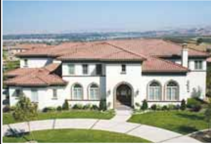
UWE MAERCZ BY APPOINTMENT

PLEASANTON $2,995,000 One of a kind! Bay Area Craftsman custom home, Ruby Hill 6000+/-sf on a 26,000+/-sf corner lot. Located on a cul-de-sac with no neighbor across the street, fantastic views! Completion Spring 2007.