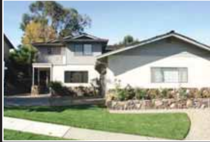
TIM MCGUIRE BY APPOINTMENT

PLEASANTON $799,950 Custom 2650+/-sf home with 3bd/3ba plus office. On a quiet street with large lot, solar pool, side yard access, no rear neighbors. Near Hearst/Pleasanton Middle schools as well at 680 freeway access.