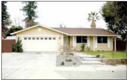
4618 MOHR AVE, PLEASANTON ENTERTAINER'S DELIGHT $834,800 3 BR 2 BA exceptional lot, updated kit w/granite counters, tile flrs, w/pool, spa, gazebo & superb loc 925.847.2200